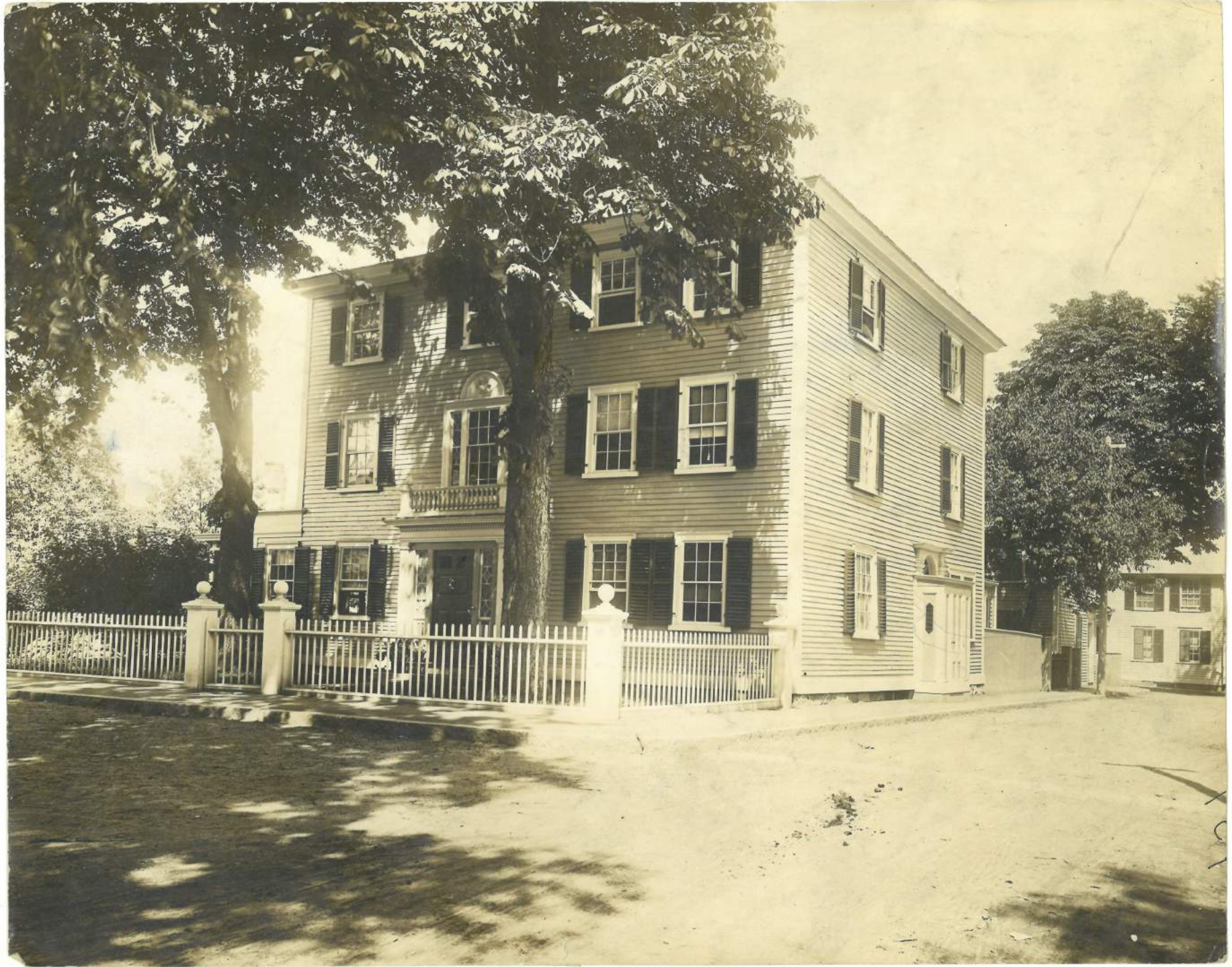
J. BUBIER HOUSE, 1730