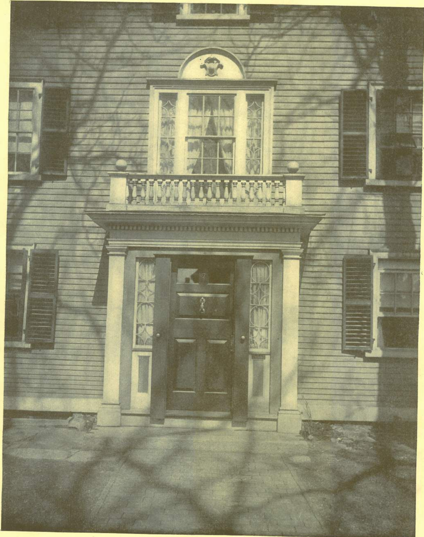
OLD COLONIAL DOORWAYS