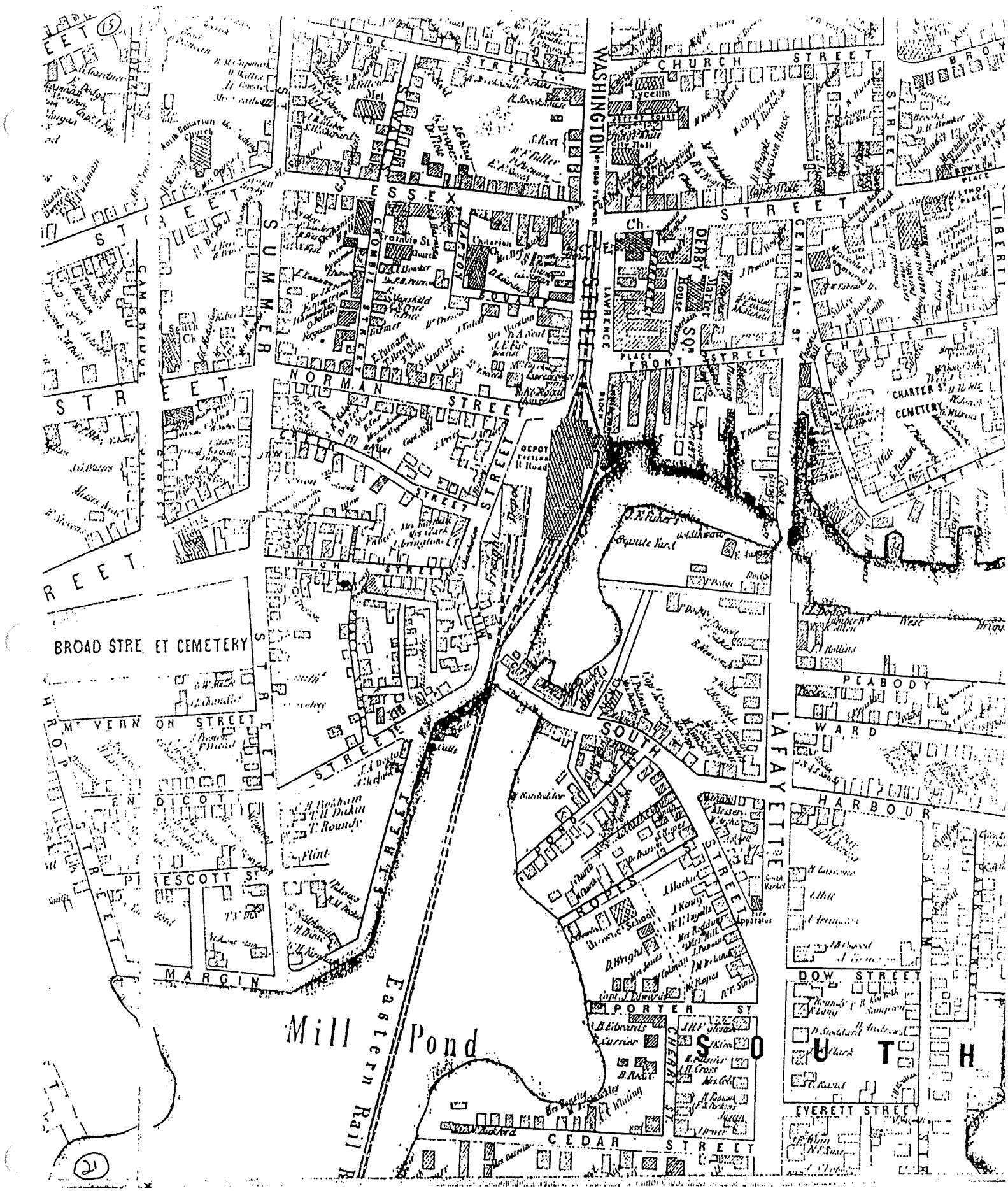
1851 Atlas of Salem