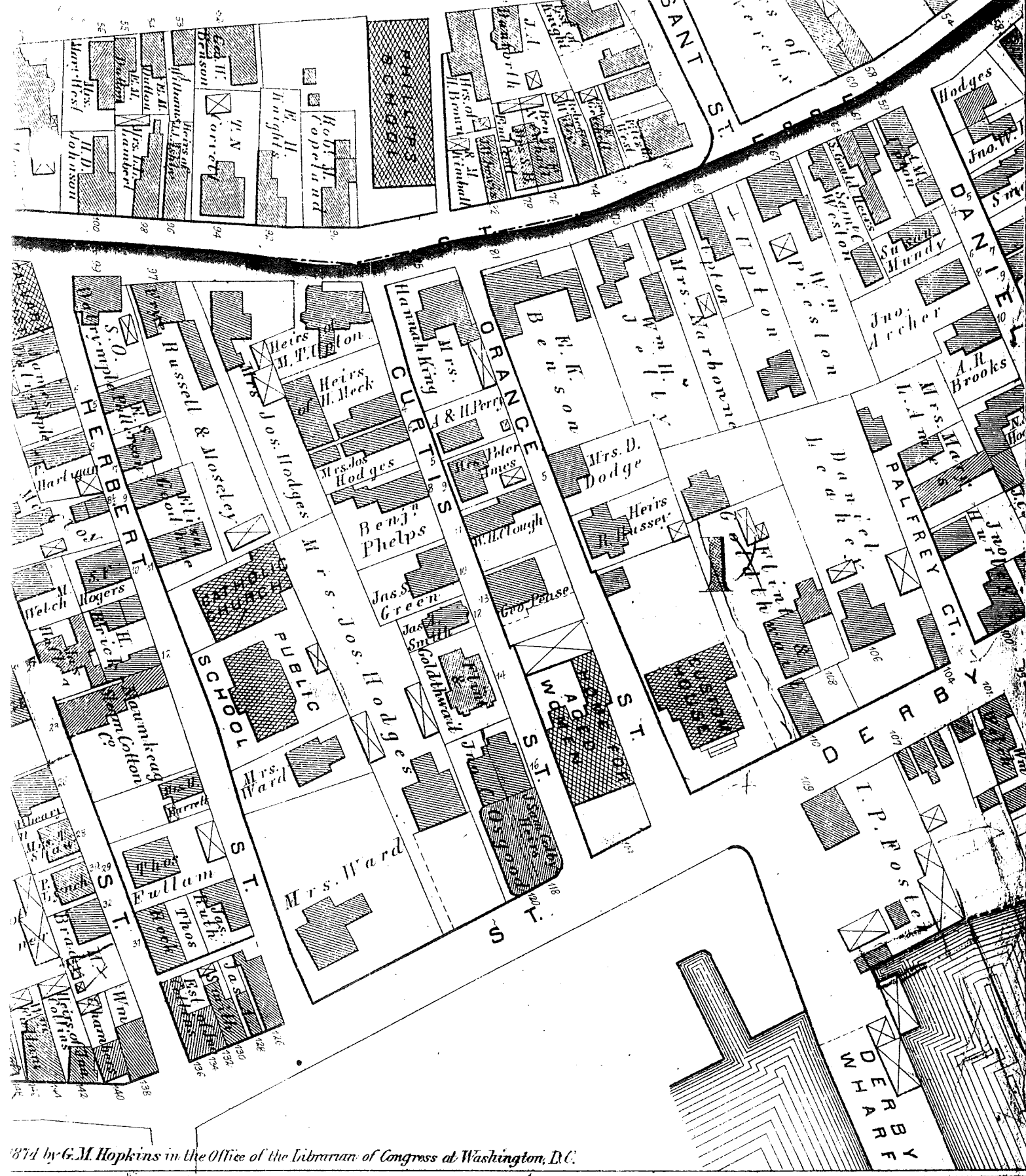
1874 by G.M. Hopkins in the Office of the Librarian of Congress at Washington, D.C.