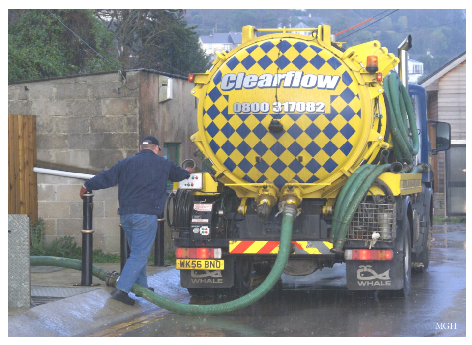
Another 2,200 gallons of 'Golant Solution' about to start its journey to Par