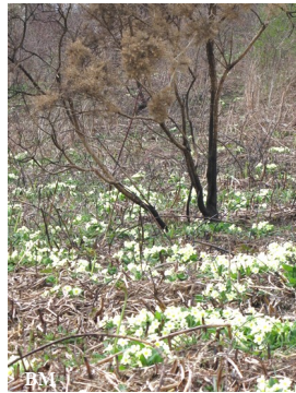
Large clumps of primroses surround a blackened bush.