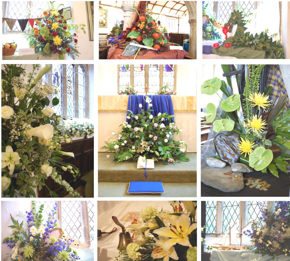
A composite of pictures taken by Karen Hamnett of a few of the floral works of art.