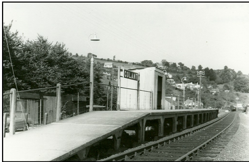
One of the many postcards owned by Jimmy Fisher, showing Golant Halt , mentioned by Diana.