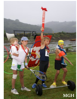
Air Ambulance casualties!