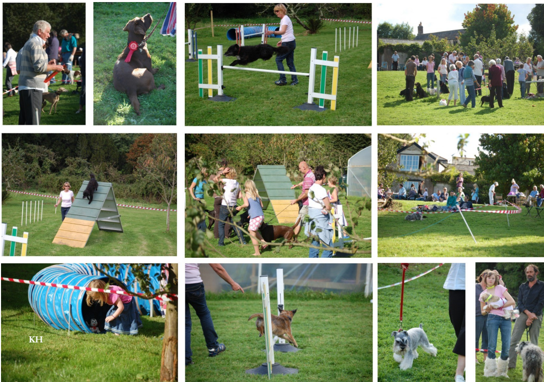
Mad dogs and Englishmen.....

Wild Thyme Farm went barking mad on Sunday 20th September as the venue for Golant's 'Dog show with a difference'. Summer decided to put in a brief appearance, setting the scene for a relaxed and fun afternoon.