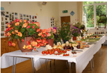
A heavily laden table of entries at the Flower & Produce Show, with Anne McCleod's wonderful begonia in the foreground!