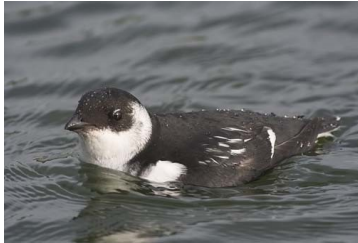
A Little Auk