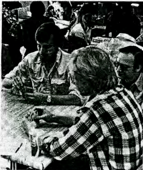
WORK AND PLAY--Students use the 10 a.m. Activity Hour for a variety of things, such as playing "spades" and making up chemistry labs.