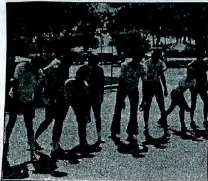
Students get set to begin the rabbit race that was held on a April 9.

MCC had a rabbit race, that is, a two legged rabbit race. The April 9 contest was broken into three divisions: women's, men's and the faculty division.