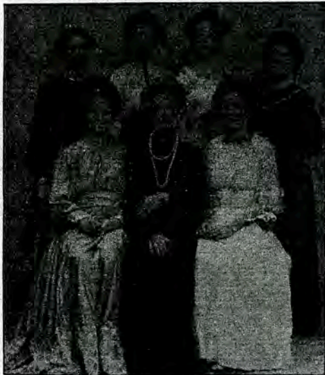
The women characters in the spring play

MCC students are admitted free, however, all seats are reserved. Call 756-6551, ext. 283 for reservations.