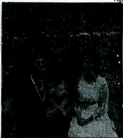
Scene From 'Ring Around the Moon'

The first and second place winners of the mile long course had a choice of either a live rabbit or an Easter basket. The third place winners received a colored egg.