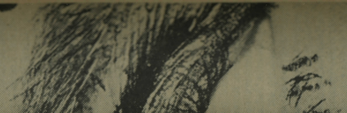
Dr.

...e said, "If you are a... ...g called a red-baiter... ...ter stay out of social... ..."