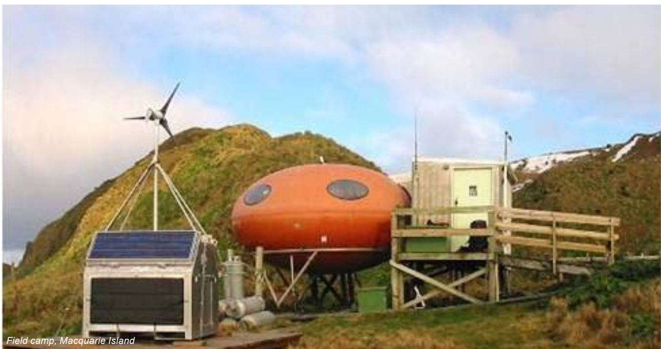
Field camp, Macquarie Island