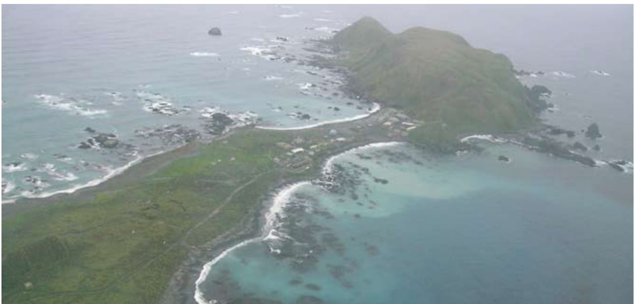
Figure 2: Field work, Macquarie Island

Incubating and moulting penguins responded at the greatest distances to a standard pedestrian stimulus, with their behaviour affected for up to 15 minutes after the visit. Reducing potentially harmful effects of human activity during the more sensitive periods of incubation and moult can be achieved by minimising visitation, or by promoting greater set-back distances to birds during these phases. Determining the effect of human activity on seabirds during key pre-laying activities of nest prospecting and recruitment remains an important direction for research.