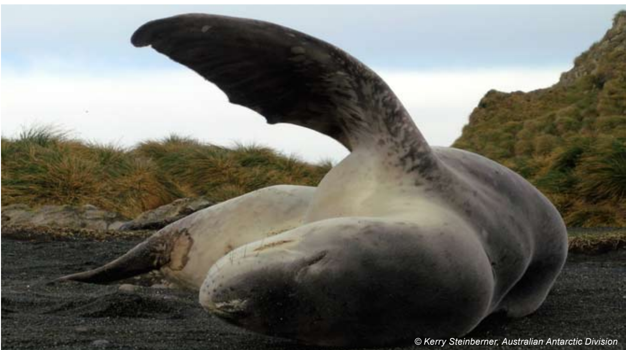
© Kerry Steinberner, Australian Antarctic Division