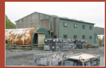
Gentoo penguins and Macquarie Island station