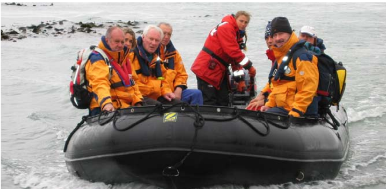
Figure 4 : Tourists arriving by Zodiac, Macquarie Island