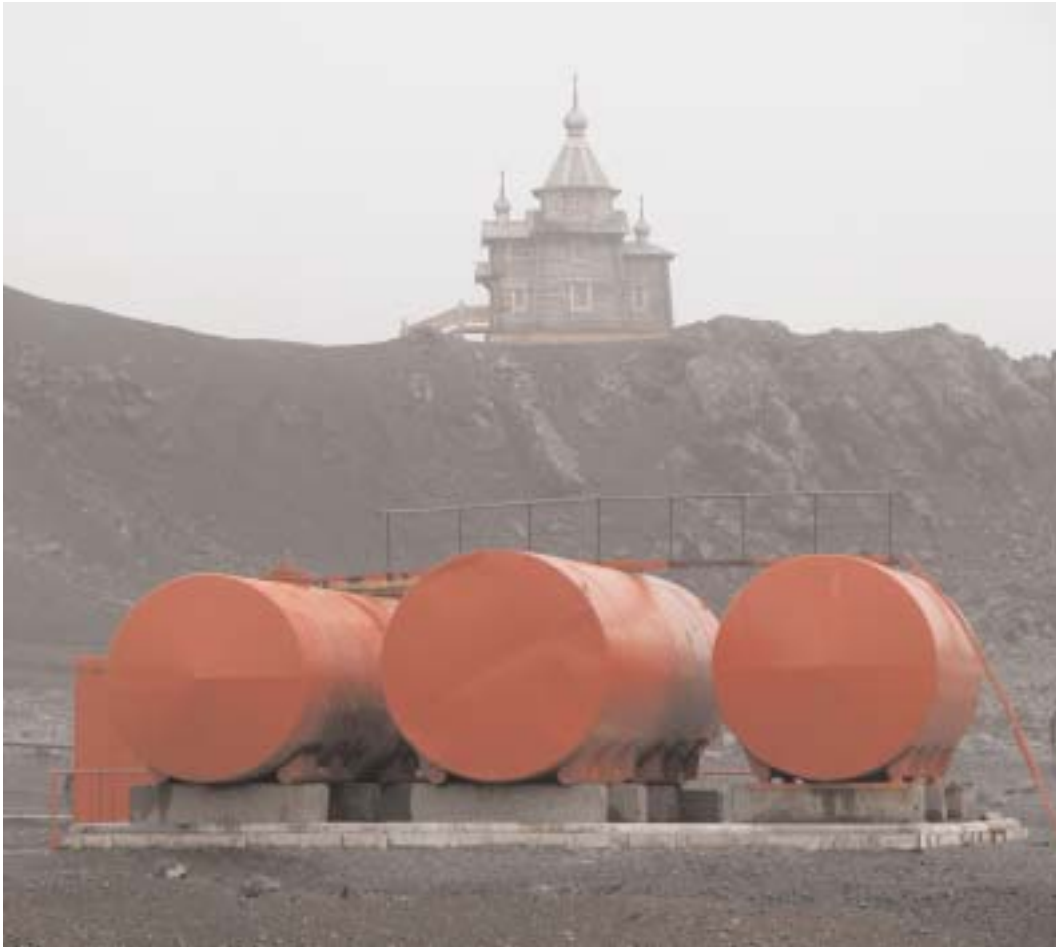
The recently constructed Russian Orthodox Church at Bellingshausen, seen over some of the station's fuel tanks