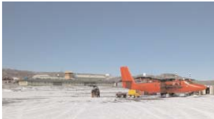
A general view of Rothera Research station with one of the British Antarctic Survey's Twin-Otter aircraft in the foreground.

The station was last inspected by Germany in 1999. To ensure impartiality, the station was inspected by the Peruvian and Australian Inspectors only.