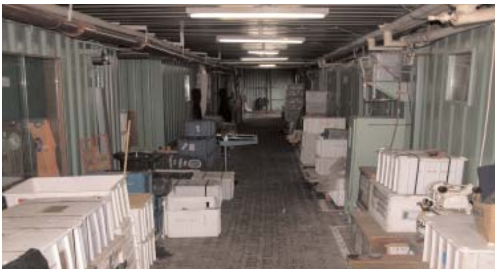
The laboratory area showing the arrangement of the shipping containers.

Nine shipping containers housed well-found laboratories. Six were located within the covered station complex. These consisted of two aquaria, three biology and a general purpose laboratory. A range of common laboratory chemicals are held (e.g. formalin, ethanol). Three laboratories situated on a slight hill to the south of the station were used for meteorology and physics, including ozone measurements.