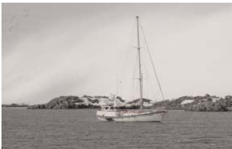
Australis – the Australian-flagged yacht at anchor in Port Lockroy.

It was not clear to the Inspection Team whether this yacht had authorisation to be in Antarctic waters, or whether it had been at anchor within one of the two sites that comprise ASPA 144 in Discovery Bay.