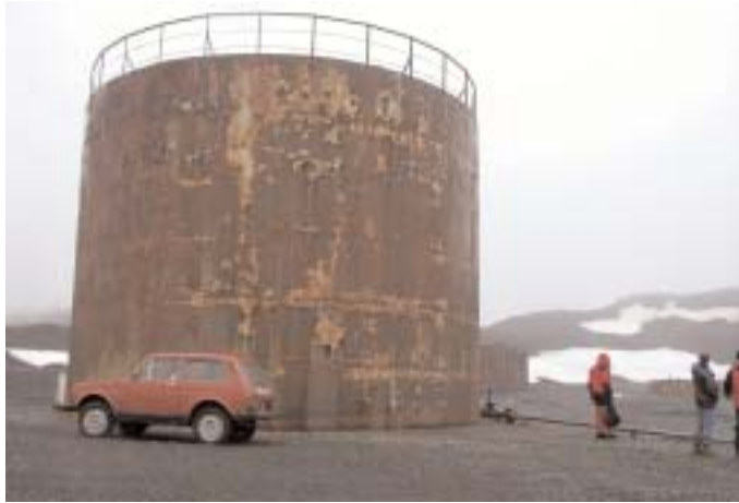
One of the large (250,000 litre) bulk fuel tanks at Rocky Cove, North of Bellingshausen.

From the truck, fuel is pumped into four holding tanks 20 metres to the east of the powerhouse, one of 50,000 litres, two of 20,000 litres, and one of 25,000 litres. These appeared to be in good condition, and are elevated on concrete plinths contained within a shallow 100mm bund. This was however penetrated by a 50mm open drain pipe. The tanks are bottom-fed and connected through an adjacent pump house via underground pipe to the 1,000 litre day tank in the powerhouse.