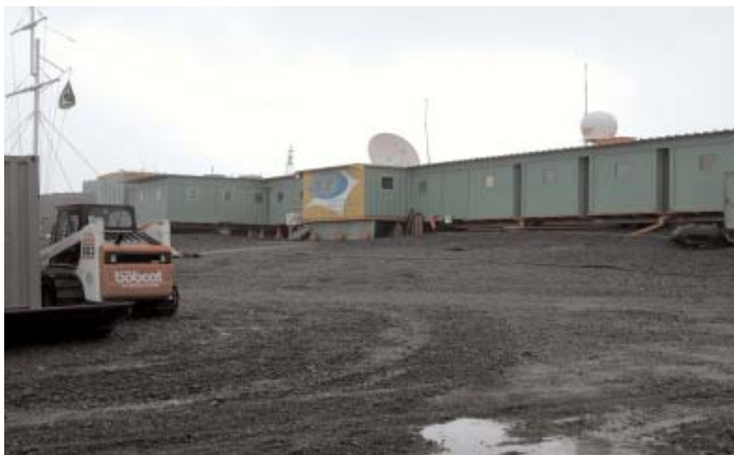
The front view of Ferraz Station.

Comandante Ferraz Station was established in 1984 as a permanent facility and is operated by PROANTAR, the Brazilian Antarctic Programme. The Brazilian Ministry of Science and Technology is responsible for the scientific research carried out there, and the Ministry of Environment is responsible for environmental issues. The station is located at Lat. 62° 05'S; Long. 58° 23'W on the eastern shore of the Keller Peninsula, Martel Inlet, at the northern head of Admiralty Bay, King George Island.