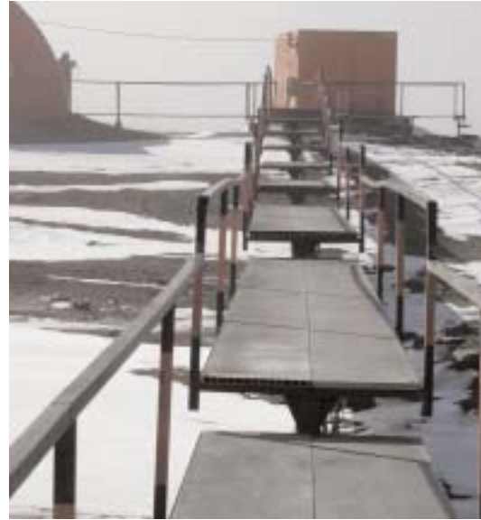
Elevated walkways which join all the station's buildings.

The compacted permafrost runway at Marambio trends SW-NE, and at 1,200 by 40 metres is designed for use by Hercules C-130 aircraft. A shorter N-S emergency runway some 400 by 28 metres adjoins the main runway at the south-western end.