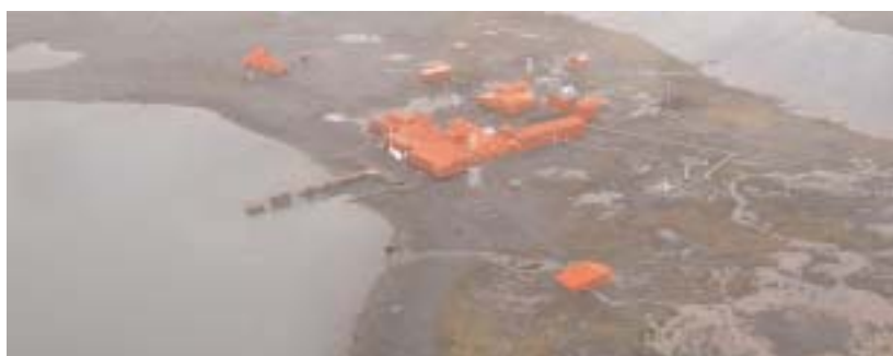
An aerial view of Capitán Arturo Prat station.

Capitán Arturo Prat Base was visited briefly by helicopter. The station is located on the eastern shore of Discovery Bay, Greenwich Island, South Shetland Islands at Lat. 62° 30’S; Long. 59° 41’W. It was unoccupied. The doors were locked and sealed, and windows boarded up. From external appearances of the buildings it would appear that they had not been occupied for at least 2-3 years. Paint was peeling off the walls and some wind damage was evident with a door torn off the ramp-shaped building to the north of the station.