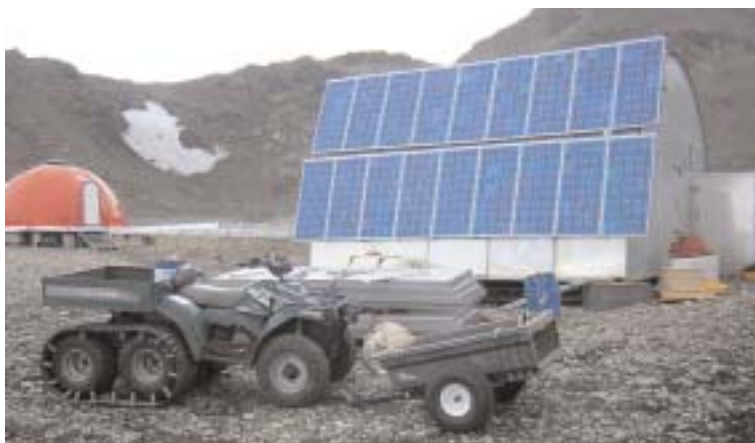
Photovoltaic panel banks at Juan Carlos I.

JUAN CARLOS I (SPAIN): Inspected 21 February, 2005