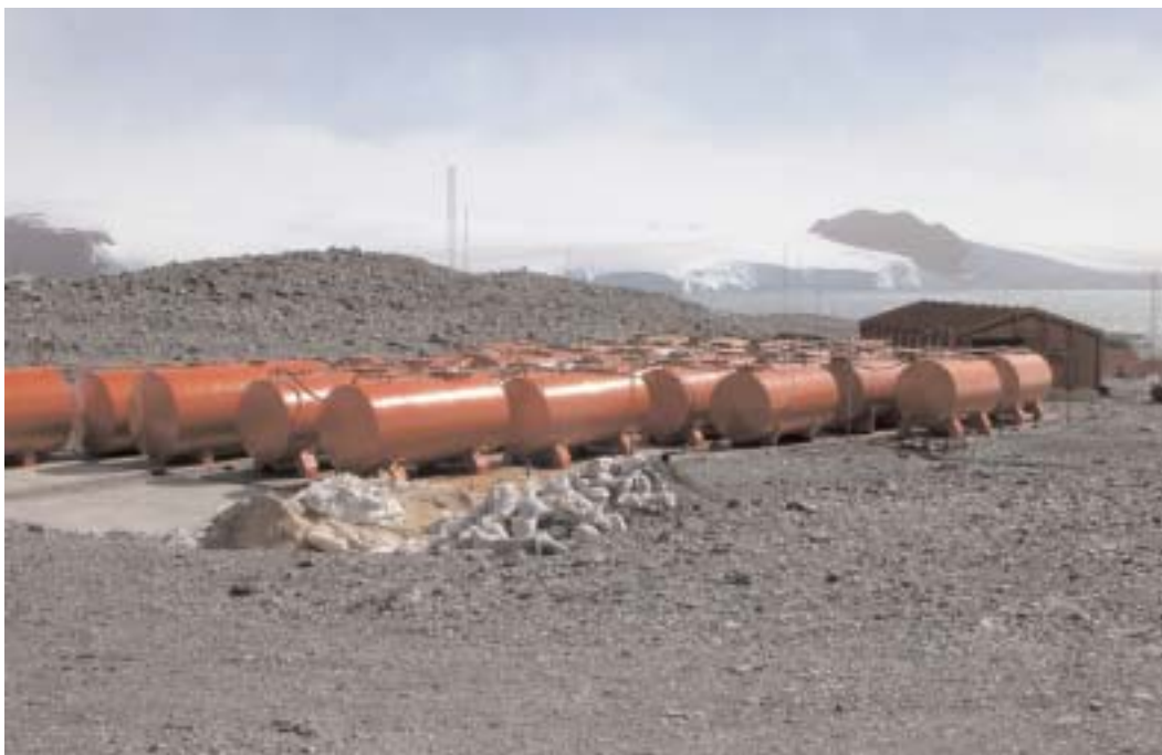
The bulk fuel-farm at Esperanza. The building materials in the foreground are for constructing an overall bund around the tanks.

A further 10,200 litres of drummed fuel is stored separately adjacent to the bulk fuel farm for vehicle and incinerator use. In addition, 6,000 litres of JP1 in drums is held for aircraft use. Overall fuel management is the responsibility of two station personnel. Three Caterpillar generators, each of 130kW, consume 216,000 litres of GOA annually. Power generation is backed up by a 96kW standby diesel generator. Electrical supply cables are mostly underground. There are no alternative energy sources.