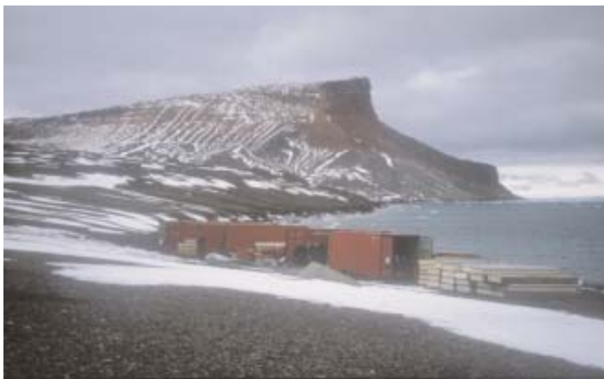
Containers offloaded on the beach for the construction of the new Czech Station on James Ross Island. Looking west towards Bibby Point.

SITE OF UN-NAMED CZECH STATION, JAMES ROSS ISLAND: Inspected 26 February, 2005