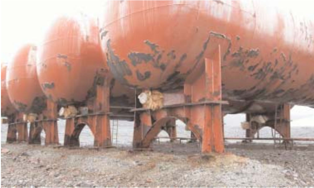
An example of badly corroded and leaking bulk fuel tanks set on severely eroded foundations

Ground contaminated with fuel oil was noted at a few of the stations inspected – at one station in particular, the Team were concerned to note extensive areas of soil saturated with diesel.