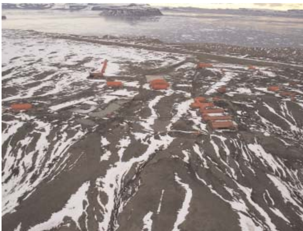
The main building complex at Marambio Station

Marambio has been inspected infrequently due largely to its relative inaccessibility. The most recent inspection was in 1988 by Russia and prior to that by the USA in 1983.