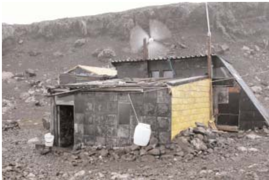
The Eco-base on Nelson Island. Note the small aerial generator.

The somewhat makeshift, but clearly serviceable, rudimentary huts are located approximately 100 metres from the shore on a gently sloping boulder beach, at the foot of a steep cliff. The main hut comprised a hallway, kitchen, larder and living room, with an office/ radio room and bedroom located at the back. An additional accommodation building, the 'kinderhaus', is located immediately to the north-west, and can sleep up to four. A small boat store is located on the shore.