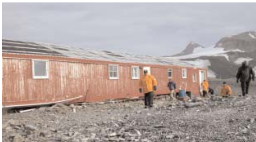
The single building comprising T/N Ruperto Elichiribehety. The lack of roofing membrane can be seen.

This Inspection visit presented a contrary situation. It was apparent that the building had not been occupied for quite some time. Esperanza personnel reported that only one brief visit, of around 2 hours, had been made by Uruguayan personnel over the past two summer seasons.