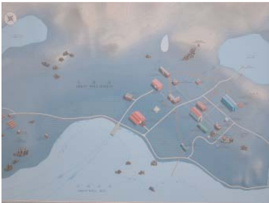
A schematic map of Great Wall Station. The main fuel farm is to the left of the picture. The large blue building is the newly constructed generator house. The green building, formerly the Infirmary/Recreational rooms, has since been removed.

Most, if not all, of the original buildings were showing extreme signs of corrosion and decay to the point that their structural integrity might be affected. The elevated concrete pier foundations of these buildings were severely decayed with, in some instances, the interior reinforcing rods completely exposed and the concrete crumbling. The external metal surfaces of these buildings were also very heavily corroded and the roofs in some buildings were no longer water-tight.