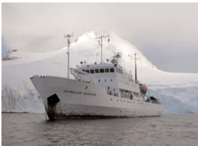
The M/V Professor Molchanov at anchor in Port Lockroy

The Russian-flagged vessel Professor Molchanov was inspected on 27 February, 2005 in accordance with Article VII (3) of the Antarctic Treaty whilst she lay at anchor between Wiencke Island and Goudier Island, Port Lockroy. At the time of the Inspection the vessel had disembarked its passengers ashore to visit the Historic Site and Monument (No. 61) of Port Lockroy. (The Australian-flagged yacht “ Australis ” was also at anchor around 150m away – see the section on “Yachts”).