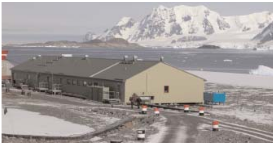
The recently constructed Bonner Laboratory at Rothera.