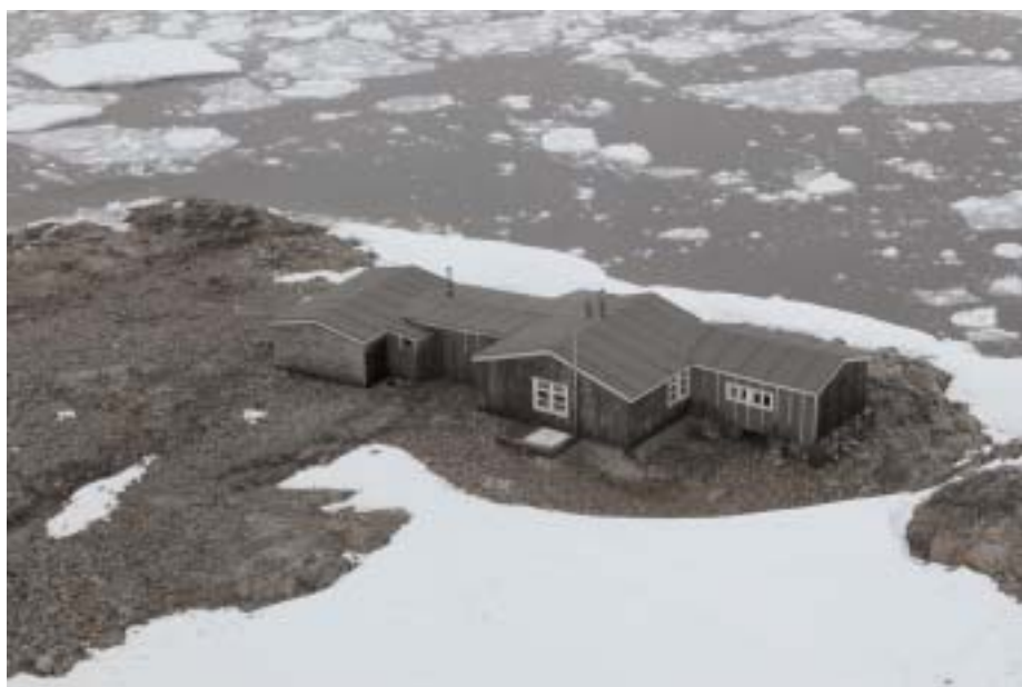
Wordie House (Base F) from the air.

A very brief visit was made to the former UK ‘Base F’ (Wordie House), at Lat. 65° 15’S; Long. 64° 16’W, on the south-east corner of Winter Island, Argentine Islands. The base was closed in 1954 when the station was transferred to nearby Galindez Island. In 1995, it was designated as HSM No. 62 under Measure 4 adopted at ATCM XIX, in recognition of its historic importance as an example of an early British scientific base.