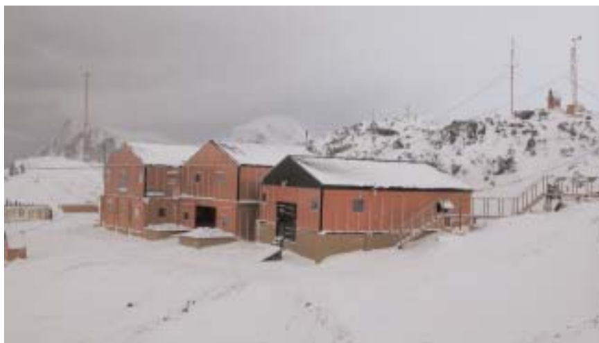
The main building complex of San Martin.