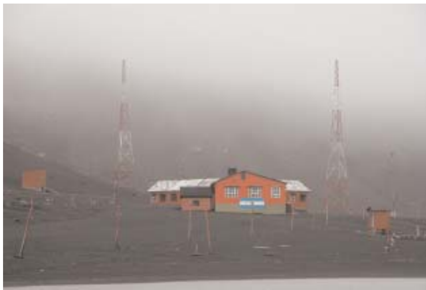
The main building Base Decepción – currently unoccupied.