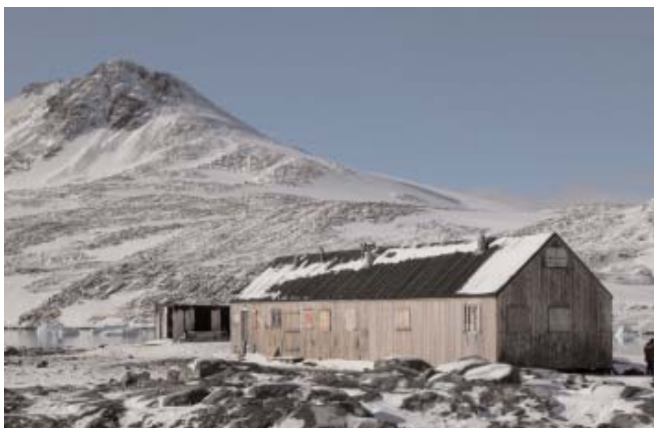
A general view of Horseshoe Island (Base Y)

This base was occupied from 1955-1960, and again briefly in 1969. Survey, geology and meteorology were carried out from Horseshoe Island. In 1995, it was designated as HSM No. 63 (along with the associated refuge on Blaiklock Island though this hut was not inspected by the Team) under Measure 4 adopted at ATCM XIX. The site was renovated with waste removed and cleaned up by BAS in 1995. Further restoration work was undertaken in March 1997. The hut is used intermittently by BAS field parties operating out of Rothera Research Station, and has been visited very occasionally by staff from San Martin (Argentina) and cruise ships.