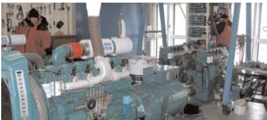
The interior of the well-appointed generator building at Akademik Vernadsky.

Power supply was provided by three 100 KvA (80 kW) Volvo Penta generators housed in the generator building/mechanics workshop. Two new generators of the same make and power output were waiting to be installed. The older engines were to be shipped back to Ukraine for overhaul. The generators, which had integral exhaust filtration, were run in rotation for 18 days. Diesel consumption was 12 – 13 tonnes per month (around 150, 000 litres per year).