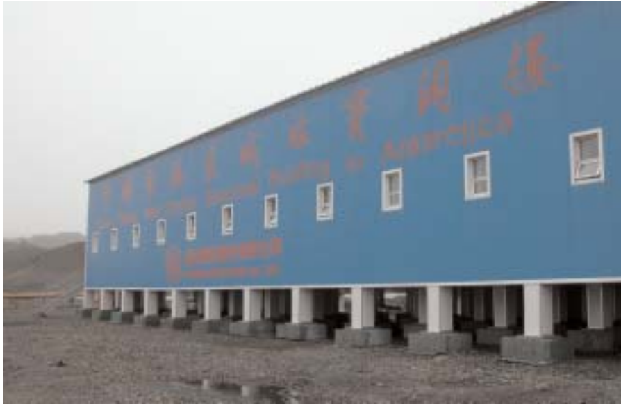
The recently constructed generator building.

Most tanks in the powerhouse fuel farm were supported on wooden sleepers, although one tank was resting directly on the gravel in a melt pool which drained through the station.