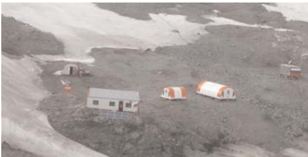
The aerial view of St Kliment Ochridiski. The main station building is left of centre, an array of solar panels in front. The two “Parcol” shelters can also be seen.

The station was opened for the 2004/05 summer in late November 2004 and was due to close within a week of the Inspection. St Kliment Ochridiski was last inspected in 2001 by the USA and prior to that by the UK /Germany in 1999.