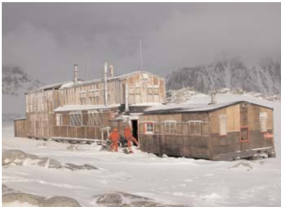
‘Base E’ Stonington Island

‘Base E’, Stonington Island (UK) was visited briefly on March 3. It is located approximately 150 metres from Stonington East Base, at Lat. 68° 11’ S; Long. 67° 00’ W.