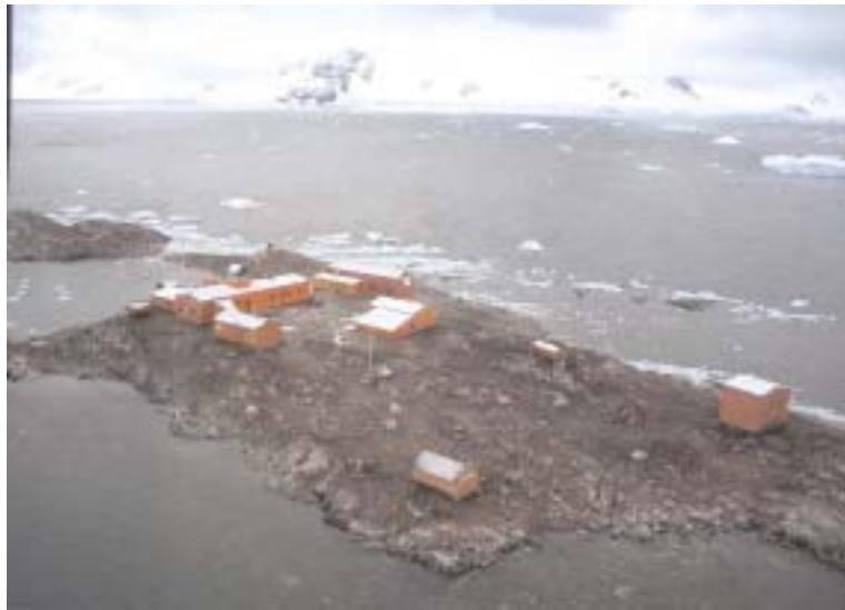
Aerial view of Presidente Gabriel Gonzalez Videla station