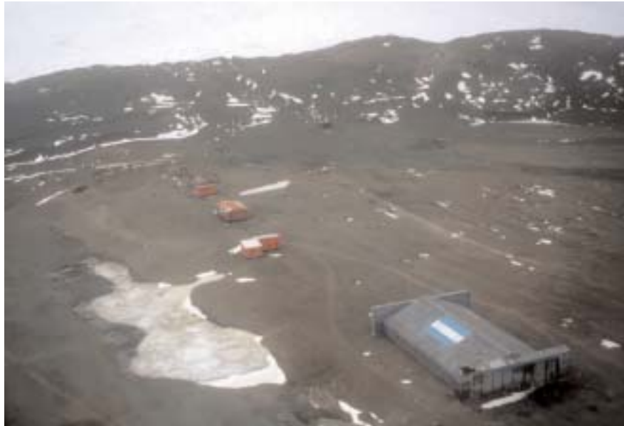
Southern end of Petrel Station, looking south-east.