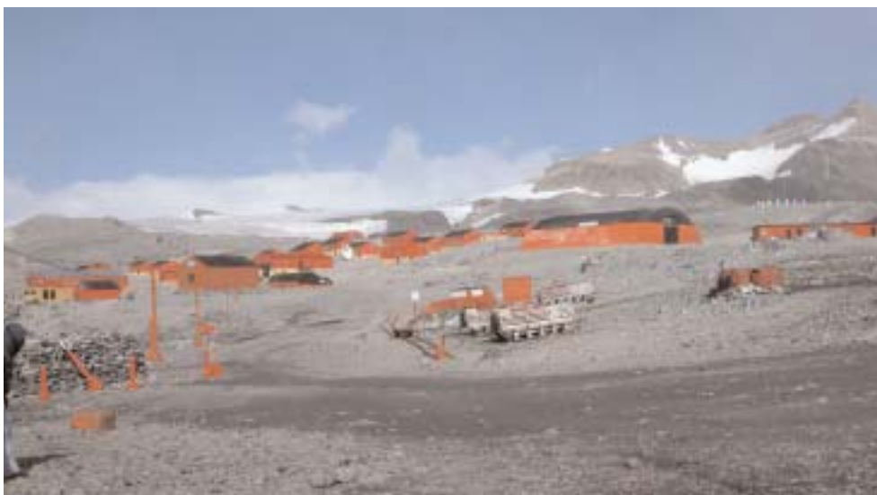
General view of Esperanza