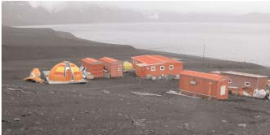
A view of part of Gabriel de Castilla showing the new laboratory building (centre) and the storm-damaged fibreglass igloo.