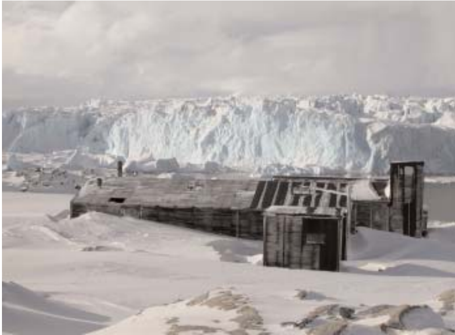
A view of East Base, Stonington

Stonington East Base (USA) was visited briefly on March 3 and inspected externally. It is located at Lat. 68° 11'S; Long. 67° 00' W, on Stonington Island, Marguerite Bay.