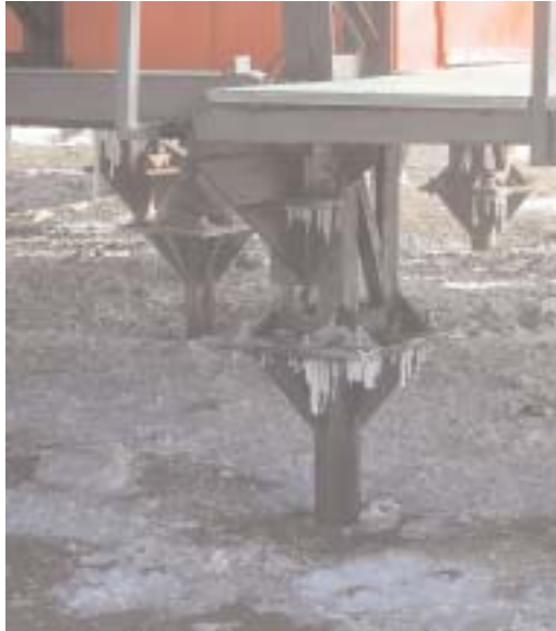
Detail of the permafrost piles supporting the building.