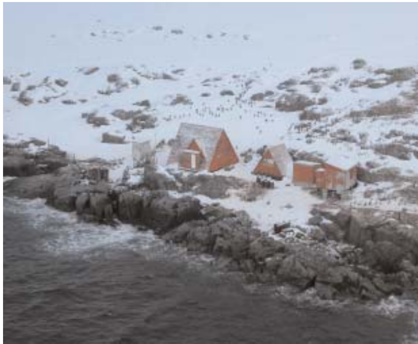
Yelcho from the air. Note the density of nesting penguins.

The team could find no indication that Yelcho had ever been inspected previously.