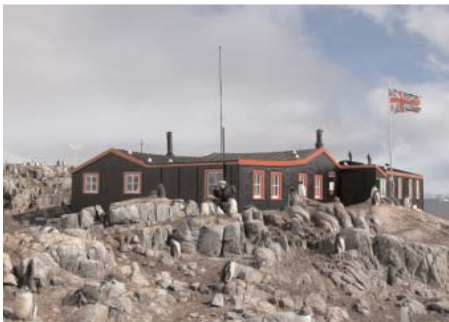
Port Lockroy Historic Site and Monument.

Restoration and conservation work at the base has been undertaken by the British Antarctic Survey and the UK Antarctic Heritage Trust, and the buildings are open to visitors. The station housed three BAS staff during the 2004/05 summer, carrying out building maintenance and conservation work, providing a postal service and managing tourist visits. The station was last inspected by the UK and Germany in 1999. To ensure impartiality, the station was inspected by the Peruvian and Australian Inspectors only.