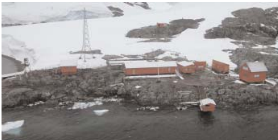
An aerial view of Almirante Brown. The bulk fuel tanks are located just out of the photograph to the right.

This station, first operational in 1951 is situated at Lat. 64° 54'S; Long 62° 52'W on Coughtrey Peninsula on the east side of Paradise Harbour, Danco Coast. The station looks west towards Bryde Island.