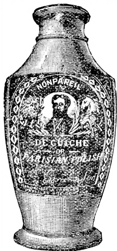
NON PAREIL DE GUICHE Parisian Polish (For Varnishing Dress Boots and Shoes) is more elastic and easier to use than any other.

7 GARRICK STREET, LONDON, W.C.; and at 26 RUE BERGÈRE, PARIS.