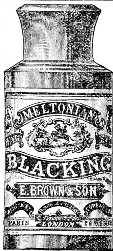
MELTONIAN BLACKING (As used in the Royal Household)

Renders the Boots Soft, Durable, and Waterproof.