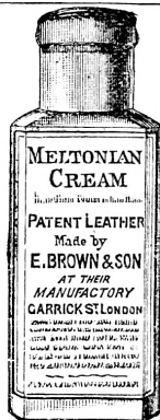
MELTONIAN CREAM (White or Black) Cannot be equalled for Renovating all kinds of "Knee Kid Boots and Saddles."

Renders the Boots Soft, Durable, and Waterproof.