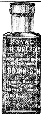
ROYAL LUTETIAN CREAM. The best for Cleaning and Polishing Russian and Brown Leather Boots, Tennis Shoes, &c.