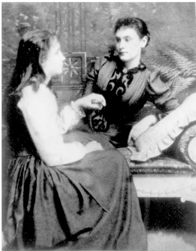
ANNE SULLIVAN MACY AND HELEN KELLER, 1893