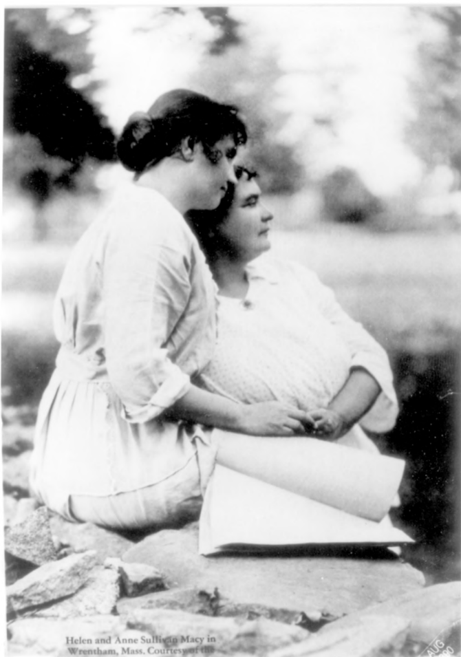
Helen and Anne Sullivan Macy in Wrentham, Mass.

1910- Helen Keller sits on part of the stone that she and Annie Sullivan rebuilt in 1909. Annie stands next to her as they enjoy another day in Wrentham. Helen has with her one of her braille books. Annie taught Helen how to read and write in braille and to type on a standard typewriter. If Helen made a mistake Annie insisted that she retype the paper. Helen rarely made a mistake.