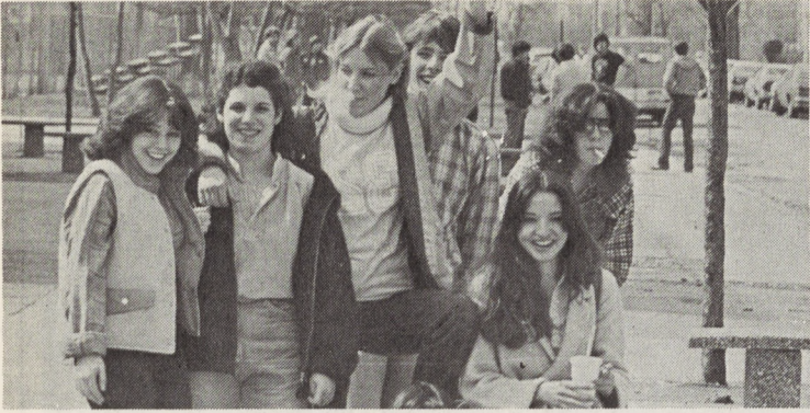
Students congregate on Mulford Street during class breaks.