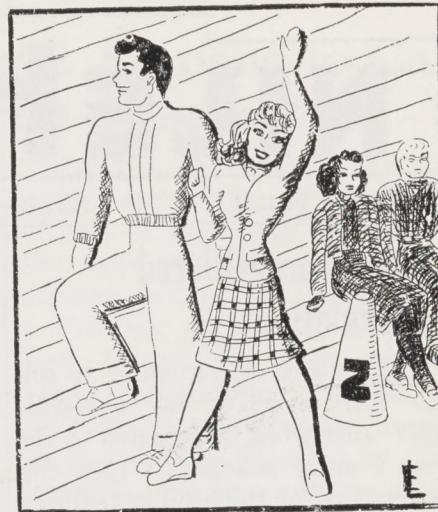
"Let's All Yell!"

Athletic events and other activities were planned for your enjoyment, and we want you, as students, to enjoy them. You can't enjoy them at home, so come out!