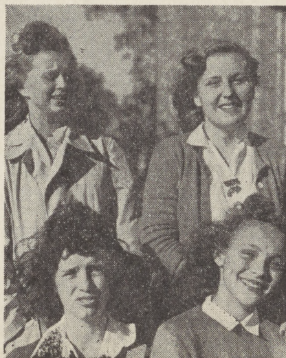
They helped plan the party!