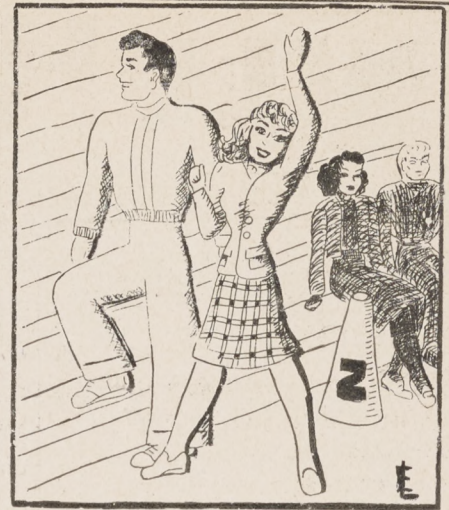
"Let's All Yell"

Athletic events and other activities were planned for your enjoyment, and we want you, as students, to enjoy them. You can't enjoy them at home, so come out!