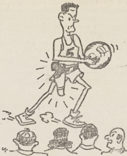
He's waiting for those wiseguys in the stands to yell shoot.