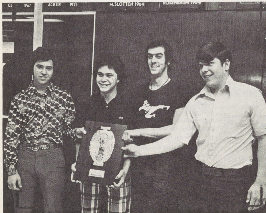
Golf team displays last year's awards.