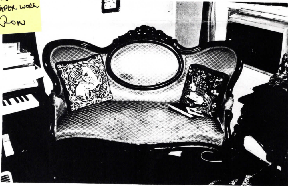
AMERICAN ROCOCO SOFA CB. 1855