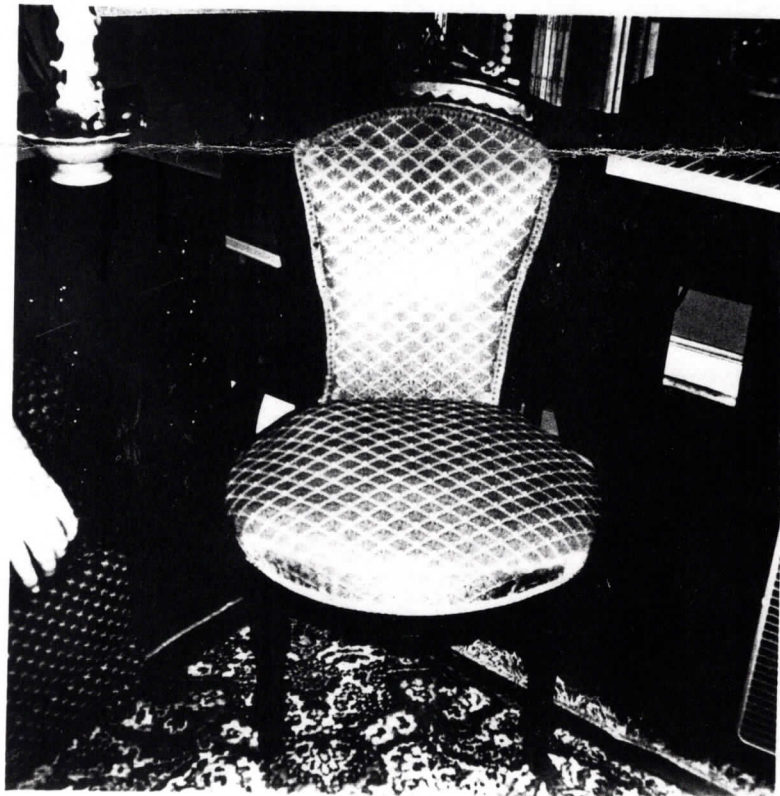
AMERICAN RENAISSANCE LADY'S CHAIR CB. 1870