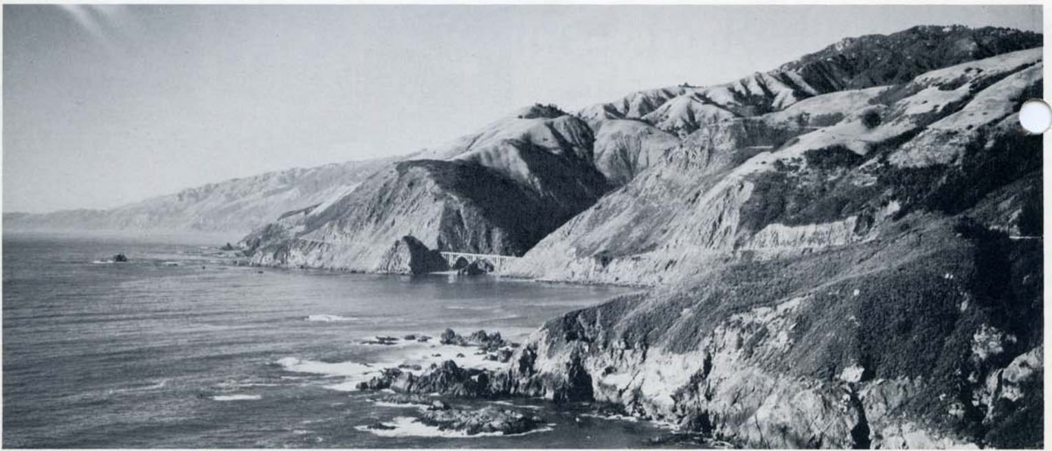
Big Creek flows into the Pacific Ocean on the Big Sur Coast of California.