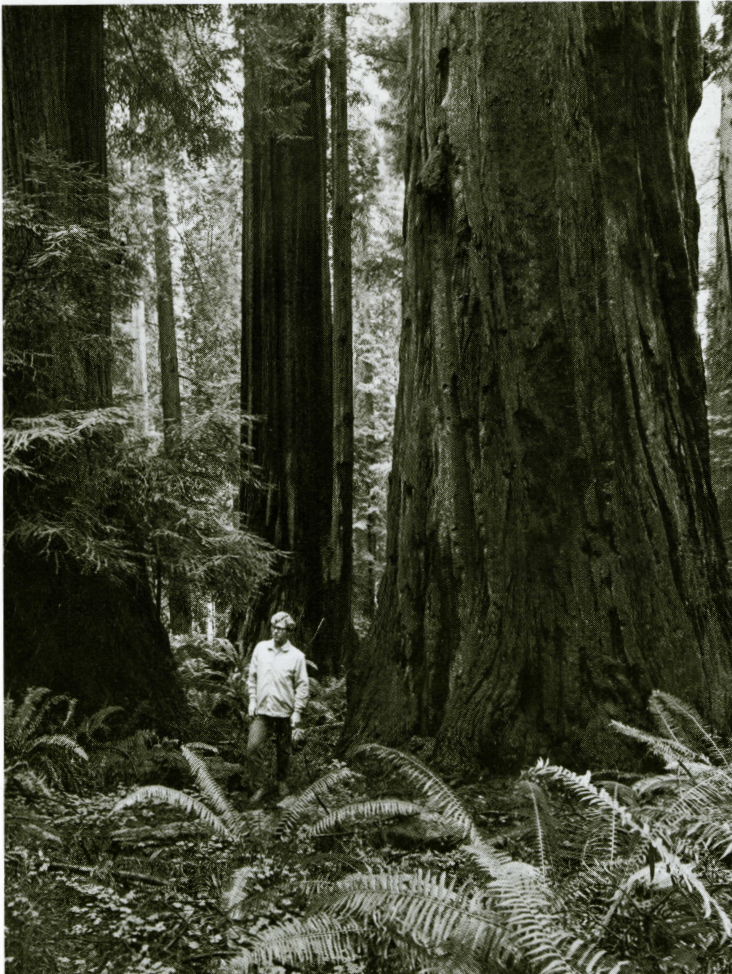
These majestic old-growth Redwoods of Skunk Cabbage Creek were saved by the League's one million dollar gift to the National Park Service in 1977. They are now part of Redwood National Park.

The finest Redwoods in the area recommended for the Redwood National Park are protected in existing Prairie Creek, Del Norte Coast, and Jedediah Smith Redwoods State Parks which