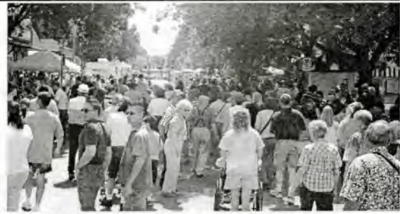
Houby Days - Czech Village Main Street

Houby days were held in Cedar Rapids' Czech Village May 16-18 th . Great weather brought out a great crowd. Along with traditional Czech music entertainment, events included A Taste of Czech & Slovak where visitors could taste various ethnic dishes, an egg & mushroom breakfast, the Miss Czech Slovak Iowa Pageant (see articles on pages 3-5), a parade, a Houby contest, a kolach eating contest, Maypole dances, and a button Accordion Jamboree.