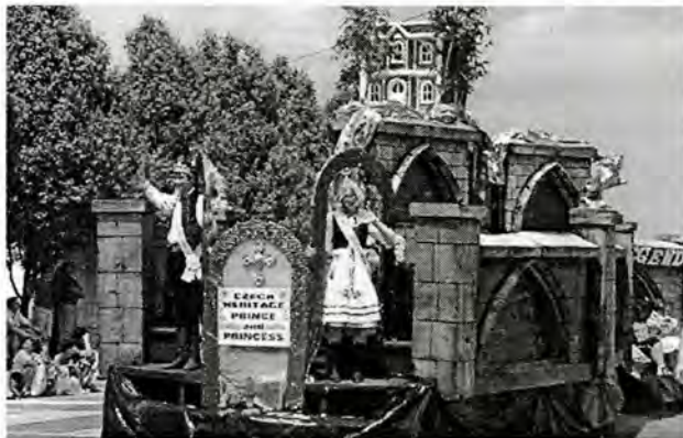
Houby Days Parade with Czech Prince & Princess