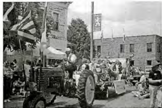
Even the Tractors Wore Czech & Slovak Colors