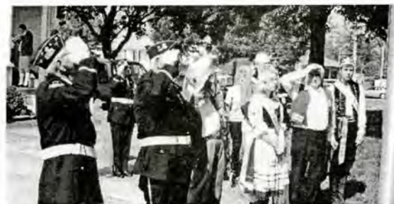
The Czech Heritage Foundation Donated New Flags for the Flag Raising