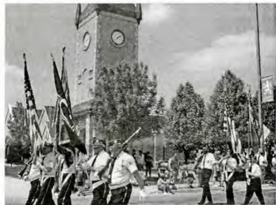
Opening Parade Color Guard Passes NCSML

Houby days were held in Cedar Rapids' Czech Village May 16-18 th . Great weather brought out a great crowd. Along with traditional Czech music entertainment, events included A Taste of Czech & Slovak where visitors could taste various ethnic dishes, an egg & mushroom breakfast, the Miss Czech Slovak Iowa Pageant (see articles on pages 3-5), a parade, a Houby contest, a kolach eating contest, Maypole dances, and a button Accordion Jamboree.