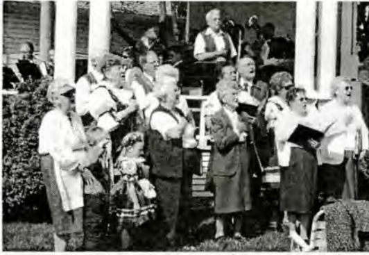
American, Czech, and Slovak Anthems at the Bandstand