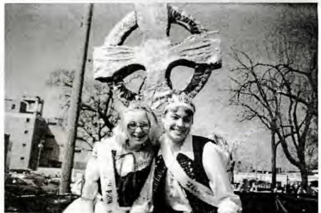
Best Overall in St. Patrick's Day Parade