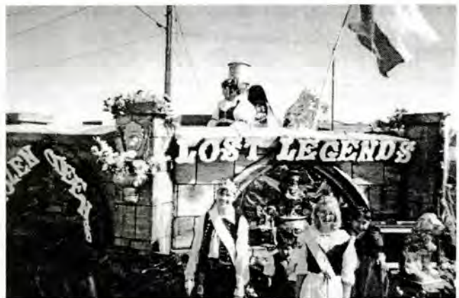
1 st Place in St. Joseph's Day parade