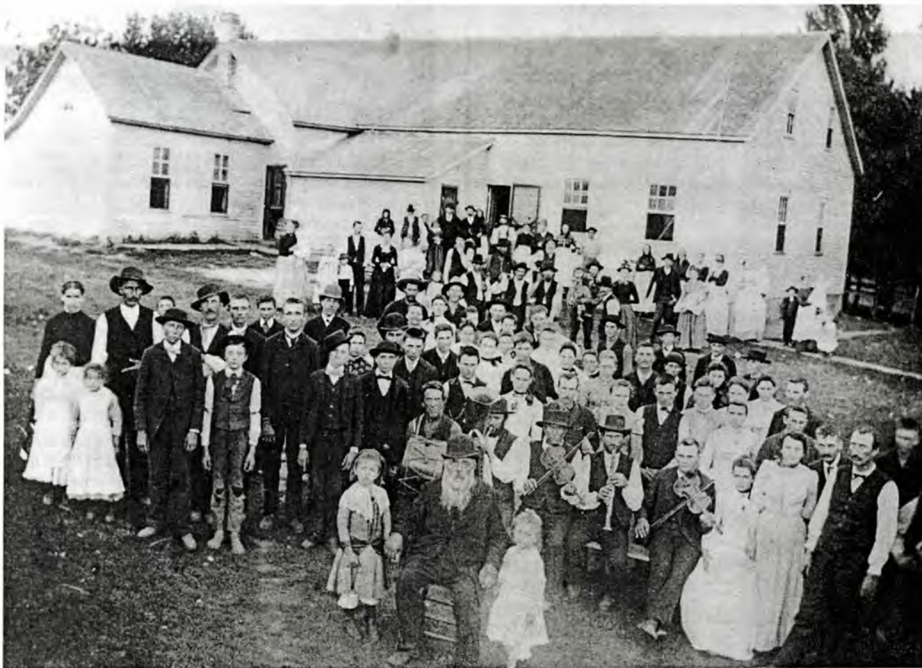
1885 Dance Hall, Guests, and Entertainers

There is nostalgia in this photograph taken back in 1885. It is of a dance in Monroe Township, located three and a half miles southwest of Swisher, Iowa.