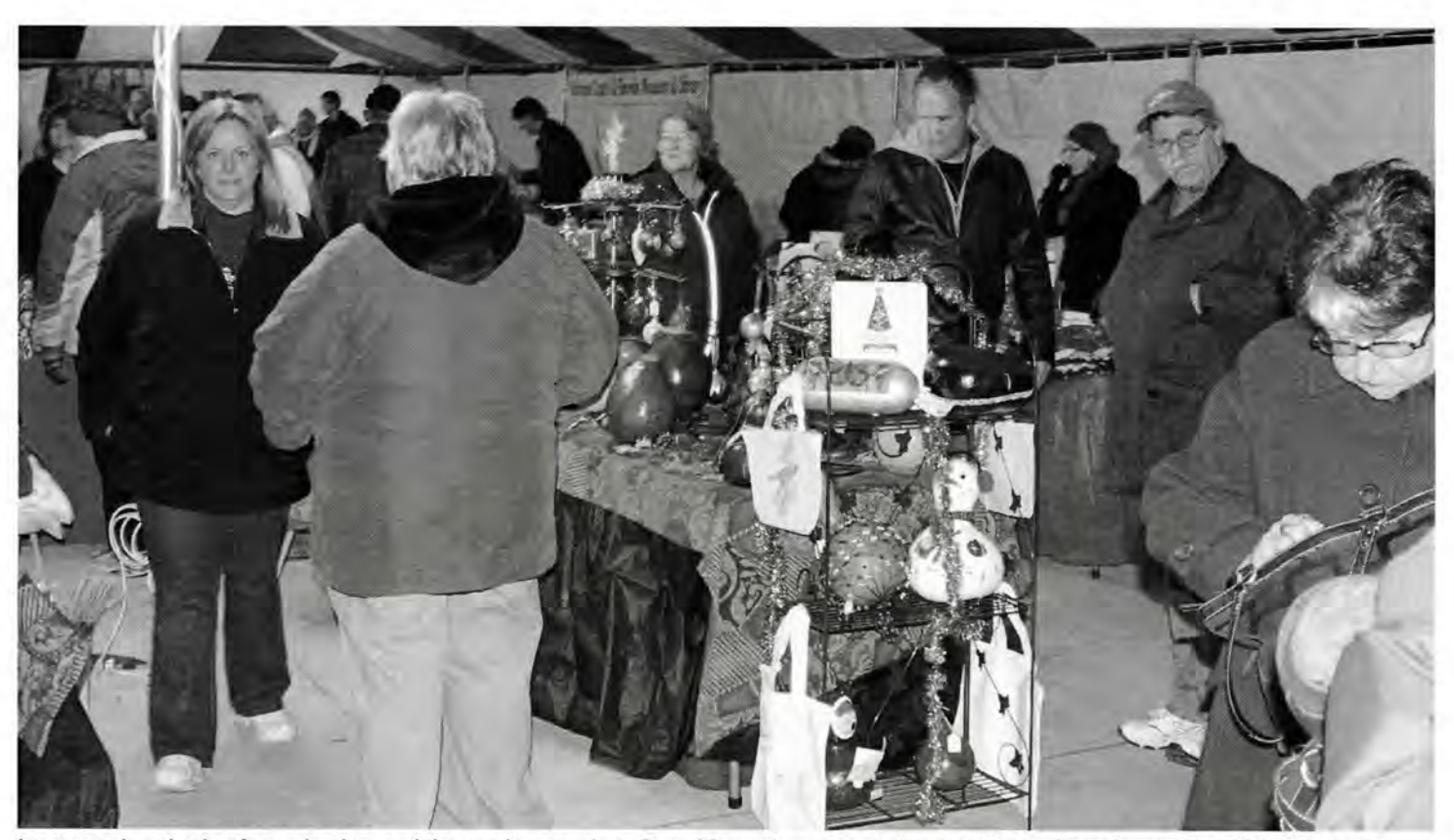
Last year hundreds of people shopped the outdoor market. Over 20 vendors set up shop in a heated tent located on 16th Avenue in Czech Village. This year's event promises to be just as big.