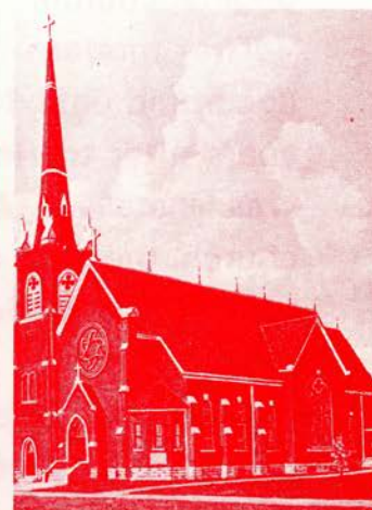
1904 to present

1224 5th Street S.E. Cedar Rapids, Iowa Rectory Phone 319/362-8061 Masses: Saturday - 6 p.m. Sunday - 8 a.m. & 10:30 a.m.