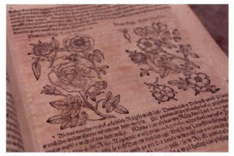
A page detailing domesticated and wild roses