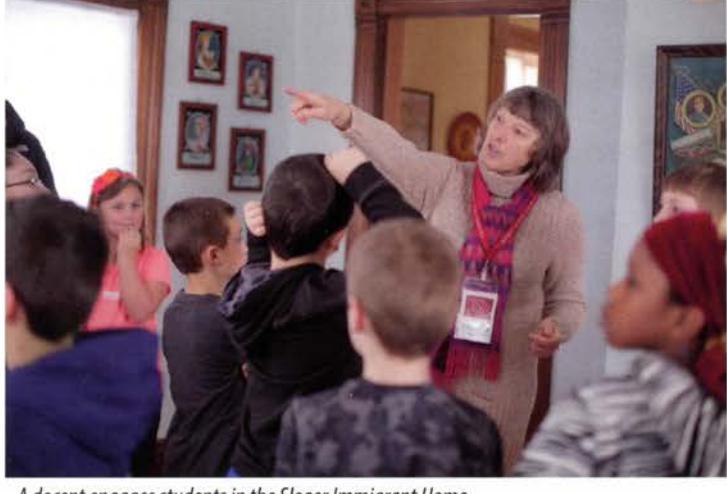
A docent engages students in the Sleger Immigrant Home.

The Sleger Immigrant Home provides a means for the NCSML to build upon lessons learned in first grade about life long ago. Using their observational and critical thinking skills, students are challenged to consider living in a 360 sq. ft. home without electricity or running water. Trained and