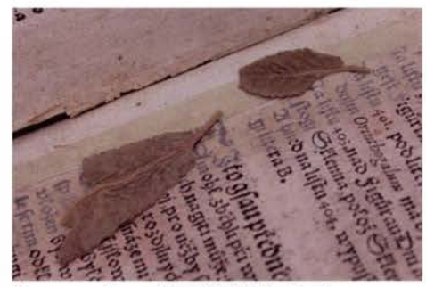
Two pressed leaves found inside the book