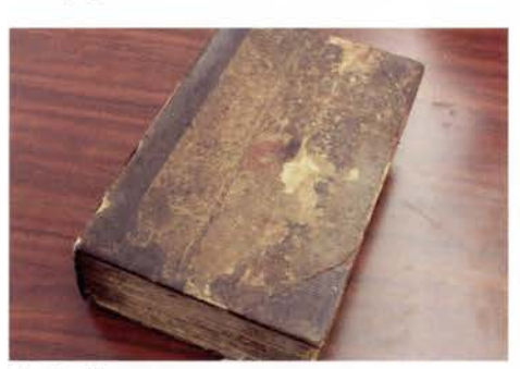
The book's cover