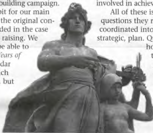
Homelands The Story of the Czech & Slovak People

The long range planning committee of the board will take the information