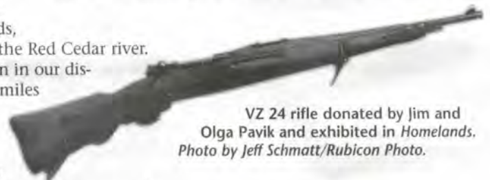
VZ 24 rifle donated by Jim and Olga Pavik and exhibited in Homelands .

to the growing English-language section of the library. In Prague in Black and Gold , the author attempts to look at the history of "magic Prague" in a different light. In the preface, Demetz states "I wish to sketch a few selected chapters of a paradoxical history in which the golden hues of proud power and creative glory, of emperors, artists and scholars, and restive people, are not untouched with the black of suffering and the victim's silence."