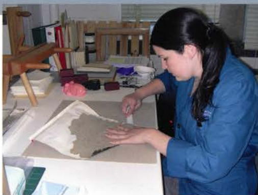
A conservator restores a phonograph record cover

Do you have a beloved artifact in need of conservation? Come to the seminars to learn best practices for conserving your family heirlooms, and what to do should they get wet, moldy or brittle. FREE and open to the public.