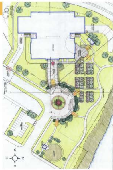
Site plan under development

The moved and expanded museum and library is planned to be 50,000 square feet, which will include larger permanent and temporary exhibition galleries, an expanded research library, educational programming space, a new museum store, (continued on page 12)