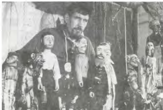
THE CZECHOSLOVAK - AMERICAN MARIONETTE THEATRE

Tickets are going fast. Call today to reserve your seat. You won't want to miss it!