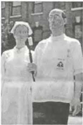
“American Dental Gothic” , Sponsored by Friends of the University of Iowa College of Dentistry illustrates the occupational themes of several of the statues.