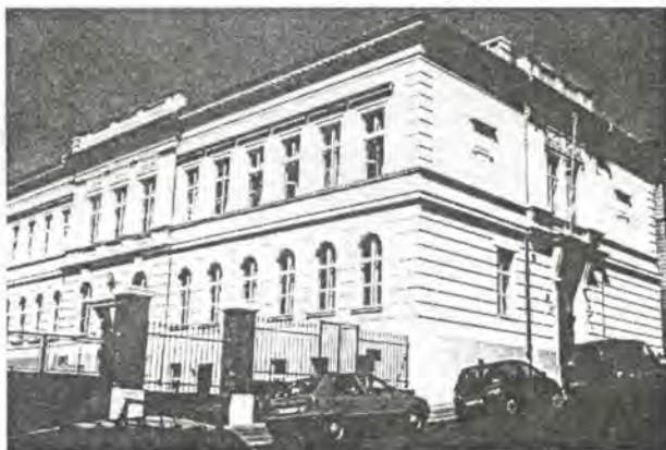
PORG School, Prague