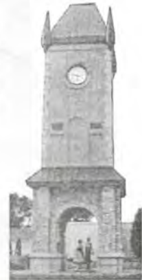
Figures Placed Prominently Under the Bell Tower at the National Czech & Slovak Museum & Library

This particular Czech couple was then placed in a prominent place of honor on the grounds of the National Czech and Slovak Museum and Library (NCSML) directly under the bell tower.