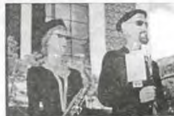
"Two from the School of Cool", Sponsored by the Kirkwood Community College Foundation includes a radio tuned to the School's Jazz station.

Following is a representative sample of the types of themes and techniques used to decorate these "Fun Couples".