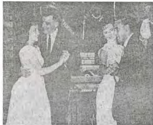
Dancing on the Kapa Ann, 1962

On each side of the bar there was a passageway to the dance floor. On the outer side of the aisle there was a little cove, which housed the bathrooms and storage of the life preservers, required by City and State Laws. After leaving the bar area you met the dance floor, which was the main reason to take a cruise. It was 13 feet wide and 44 feet long and smooth as glass and slick, for free and easy dancing.