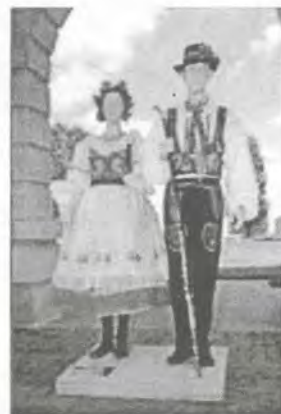
“A Work in Prague-dress” , Sponsored by the Cedar Rapids Czech community reflects the rich Czech Heritage of the City (see following feature story)