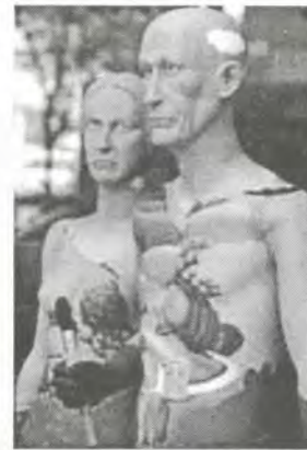
“Fields and Dreams” , Sponsored by Linn County Supervisors and Weaver Witwer Trust illustrates Grant Wood’s classic style of painting