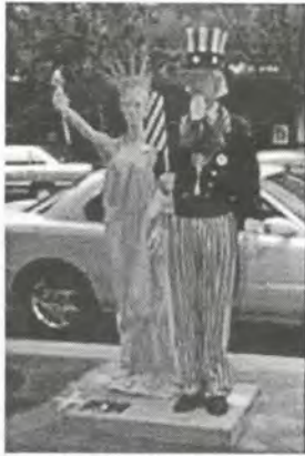
“Friends of the Festival” , Sponsored by the Cedar Rapids Freedom Festival celebrates Cedar Rapids’ 4 th of July Freedom Festival