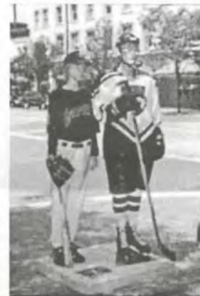
“All-American Gothic” , Sponsored by the Cedar Rapids Kernels Baseball Team, and the Cedar Rapids RoughRiders Hockey Team references the recreational opportunities in the Cedar Rapids area