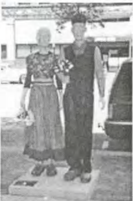
“Not Just America’s Gothic” , Sponsored by AEGON USA represents an ethnic theme, as inspired by the ties to the sponsor’s Dutch business connections