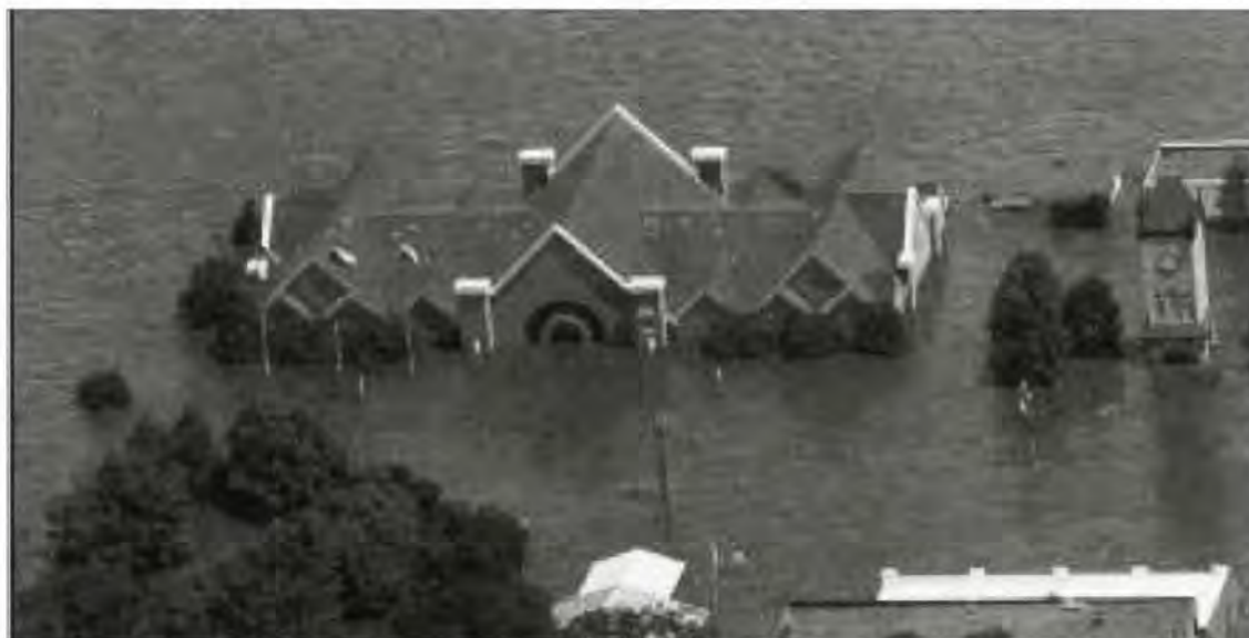
New and old. (bottom) The National Czech and Slovak Museum and Library was filled to the ceiling after June's flooding, making its Czech Village location uninhabitable. (above) The gift shop and museum has reopened at Lindale Mall, it can be found between Younkers and Holley's Shop for Men.