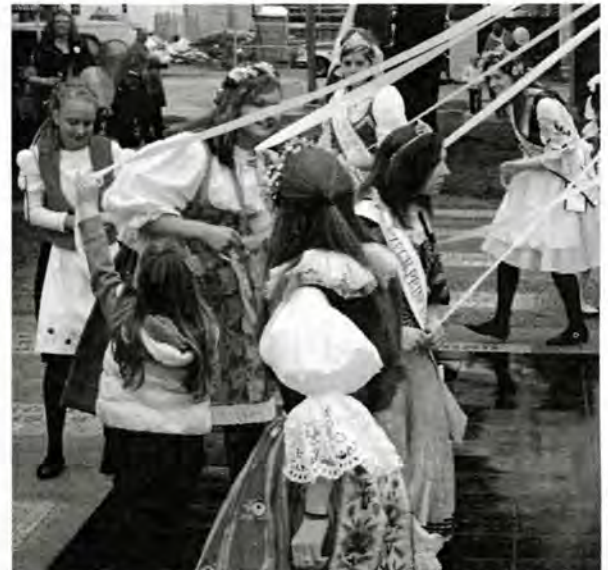
Everyone enjoys the traditional May Pole Dance.