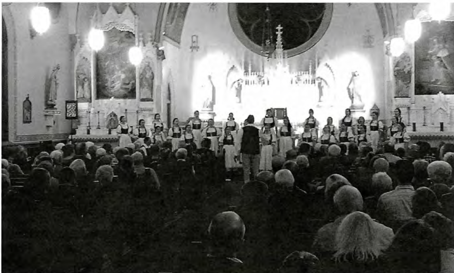
The Czech girls' choir, Jitro, performed at St. Wenceslaus March 4, 2012. Jitro was on a tour of the Midwest. St. Wenceslaus hosted the choir once before in 2005.

Jitro performed for full house at St. Wenceslaus