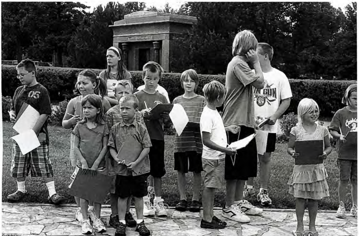
2011 Czech School students learn about their ancestry during an outing to the Czech National Cemetery.