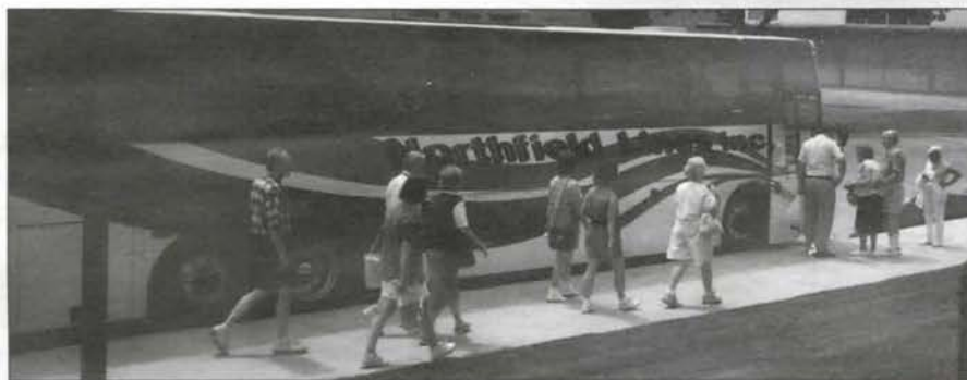
Motorcoach tours have been popular since the opening of Homelands . Discounted admissions rates are available for group tours.