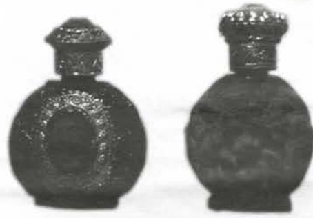
Czech glass perfume bottles for sale in Museum Gift Store.

We have dolls of various sizes in costume; Slovak cornhusk dolls and bookmarks; kitchen witches; eggs decorated by local artists and imported;