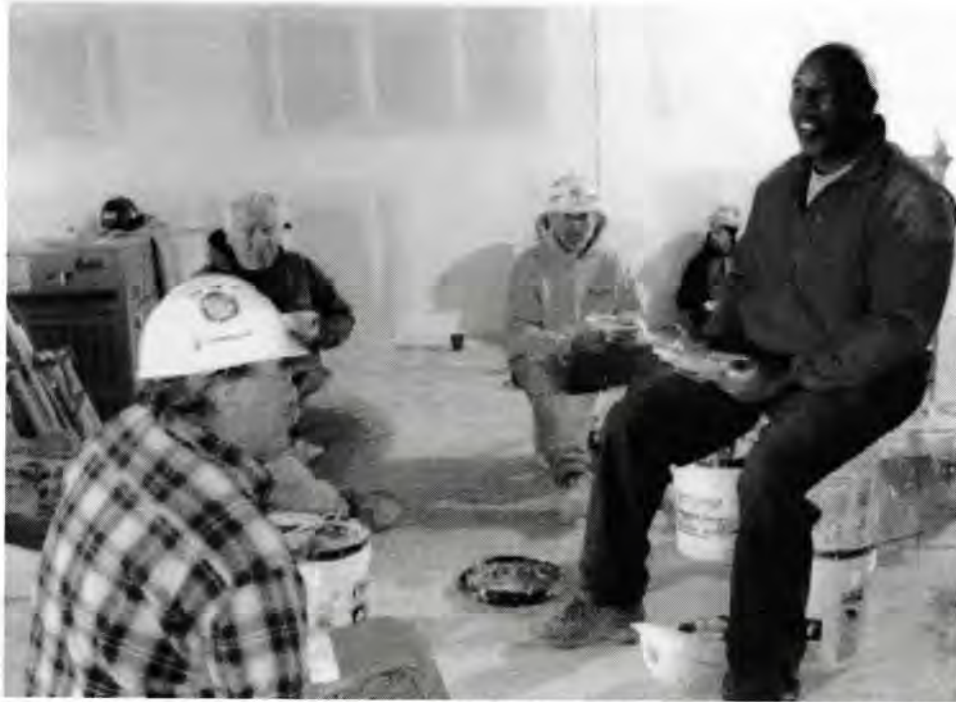
Over 80 workers from Rinderknecht General Contractors enjoyed kolache and beverages supplied by the Czech Heritage Foundation.

Just a year ago, January 2011, contractors at the National Czech & Slovak Museum & Library site began bringing in special soil to prepare ground for the historic move of the largest museum ever to be moved.