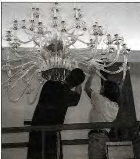
Installation of the new chandelier.

None of this would have been, nor will be, possible without you — member, supporter, advocate, and hopefully cheerleader (maybe that's my job, but I'm sure willing to share it) for the National Czech & Slovak Museum & Library. Always know how much we respect your contributions of time, interest, and financial resources, and how we are working to make your museum & library the very best it can be today, tomorrow and well into the 21st century. ■