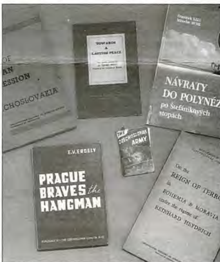
Books recently donated to the library.