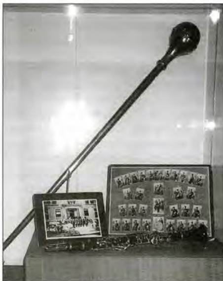
Czech Band memorabilia on exhibit.

Word has been getting out that the library accepts materials in a number of different languages — including English! An example is a small donation of books