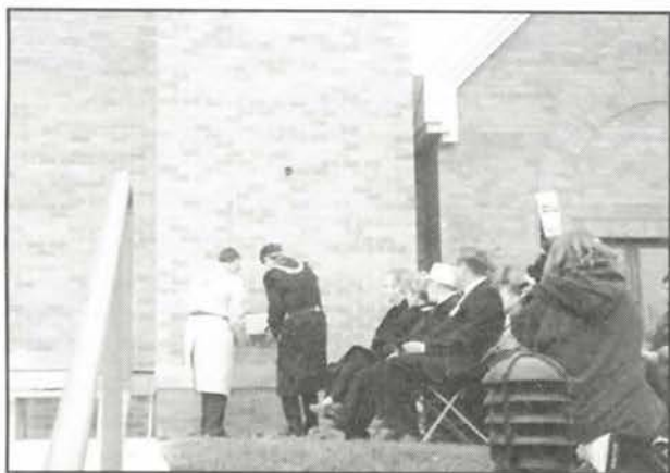
The cornerstone, containing a time capsule filled with memorabilia, is put into place in the Museum & Library by two members of the Grand Lodge of Iowa, A.F.& A.M.