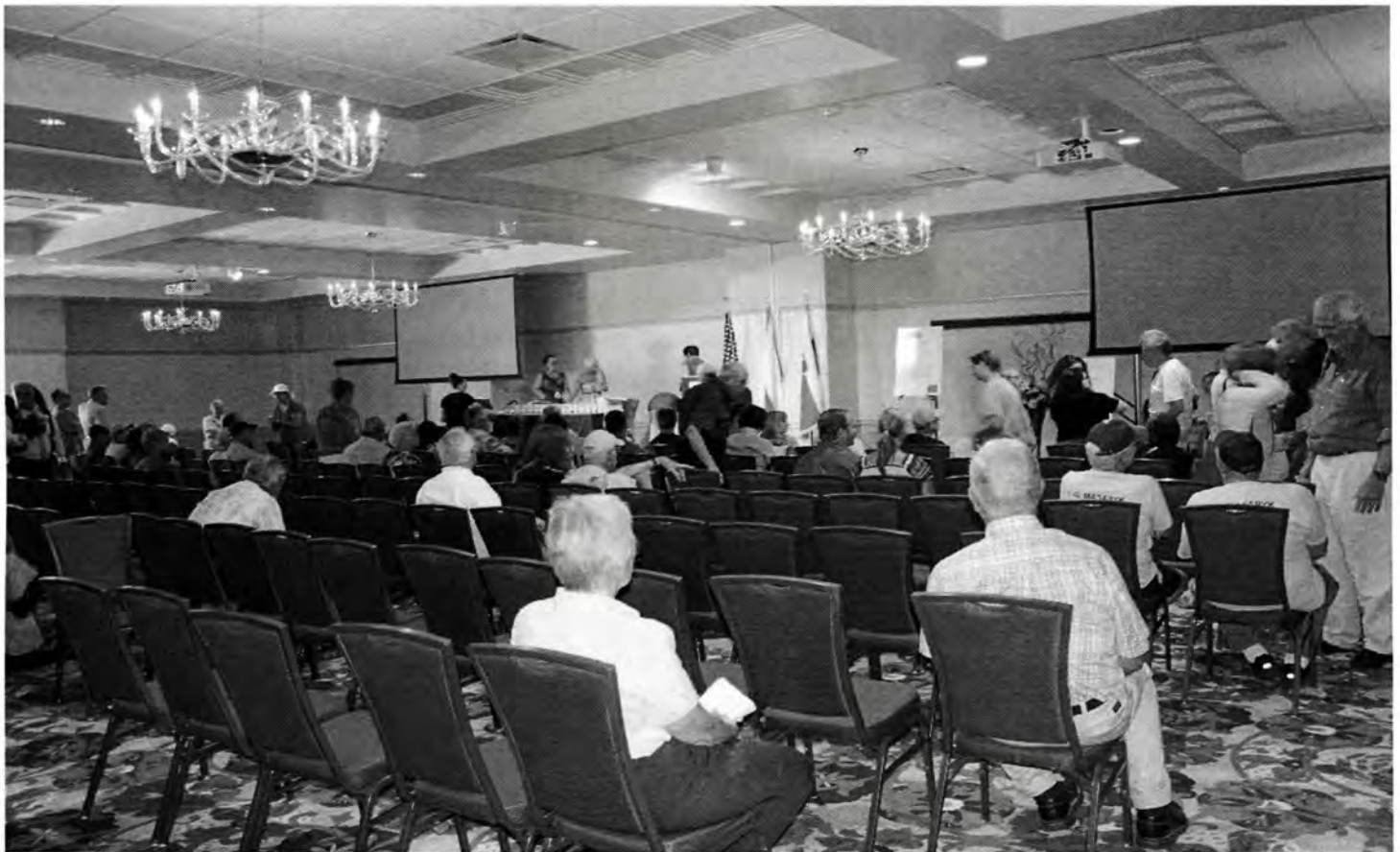
The reception hall seats 400.