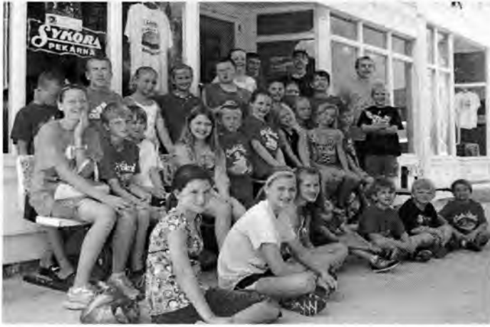
The Czech School class of 2012 took a field trip to Sykora Bakery in Czech Village in July.