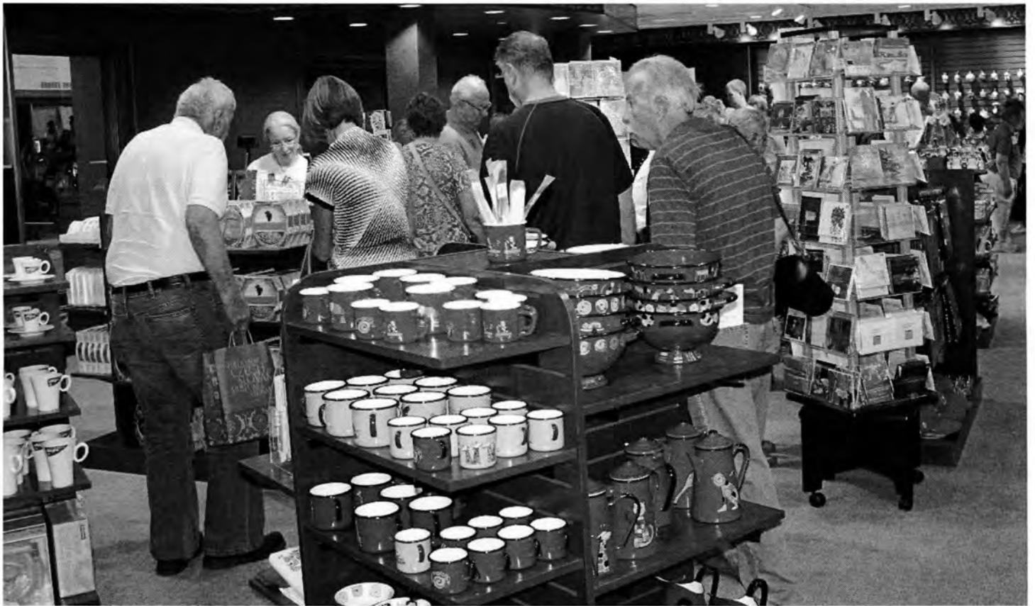
The expanded museum store.