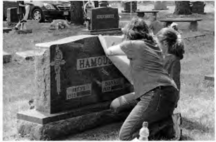
Exploring the Czech National Cemetery in Cedar Rapids. Students took rubbings of the historic Czech names off the gravestones.