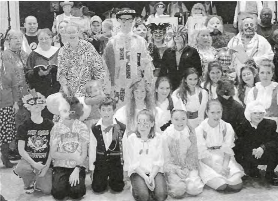
Sibřinky party-goers dressed up for the event.

Sibřinky, the Czech Mardi Gras, and Sokol fund raiser was held Feb. 10, 2013 at Sokol Cedar Rapids, 5200 18th Ave. SW. The second annual event included music by The Czech Plus Band, dance by Světlušky, plus food, games, and of course costumes! All proceeds went towards Sokol's efforts to build a kitchen in their facility. Sokol relocated to their new building in 2009 after the flood of 2008.