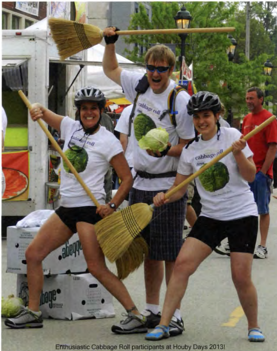
Enthusiastic Cabbage Roll participants at Houby Days 2013!