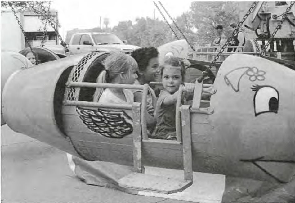
Youngsters enjoyed carnival rides at the annual Houby Days celebration held May 15 & 16, 2013 in Czech Village.