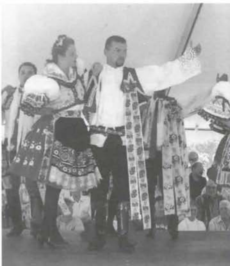
The colorful United Moravian Societies Dancers and Singers, favorites at the 2003 Dance Festival, will be back in 2004!