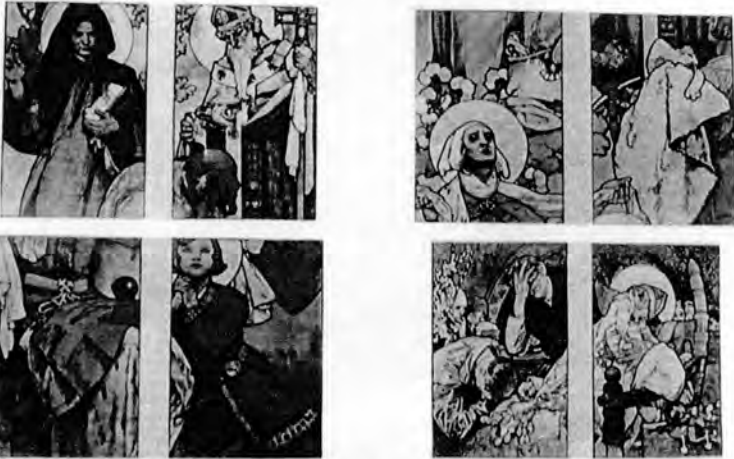
Le Pater (The Lord's Prayer)