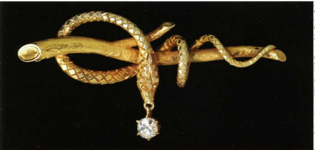
Serpent, Designer Unknown (USA); Circa 1860.

Highlighting the exhibition is the brooch that began Secretary Albright's unusual use of pins as a tool in her diplomatic arsenal. After Saddam Hussein's press referred to her as an "unparalleled serpent," UN Ambassador Albright wore a snake pin for her next meeting with the Iraqis. The press and the