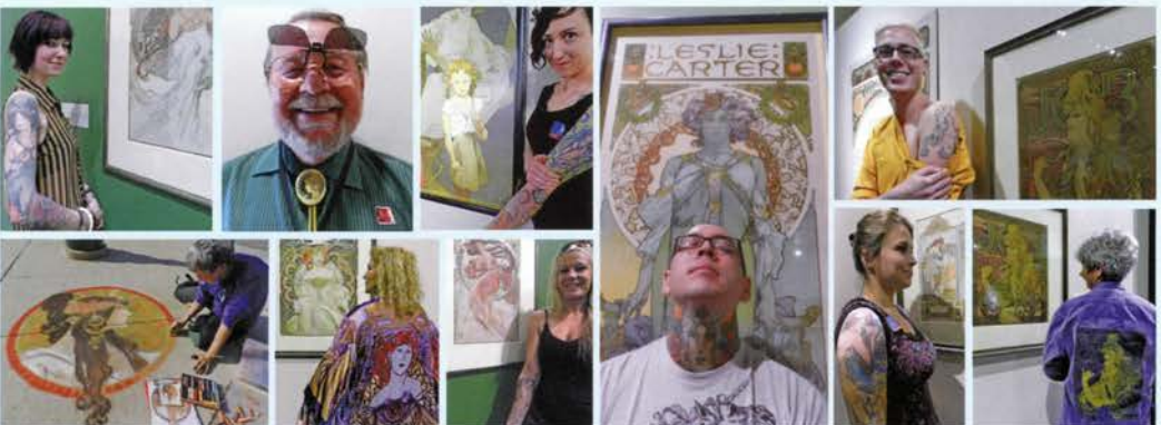
Undocumented number of visitors displayed their enthusiasm for all things Alphonse Mucha, including tattoos, apparel, and art.

15,913 Alphonse Mucha items were sold in the Museum Store.