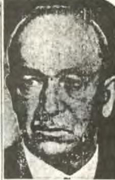
Eduard Benes. Learns From Russia.

Thus, Czechoslovakia and Benes go down in their second political death together.