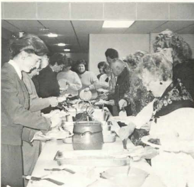
Dishing up turkey and all the trimmings at the Volunteer Recognition Dinner.

(continued from 1st column) restored the home and furnished it to reflect the lifestyle of the Czechoslovak immigrants who began settling in Iowa in the late 1850's.