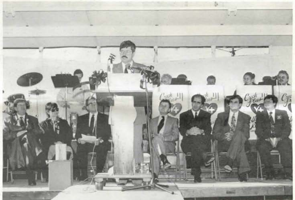
Governor Terry Branstad addressing the gathering.