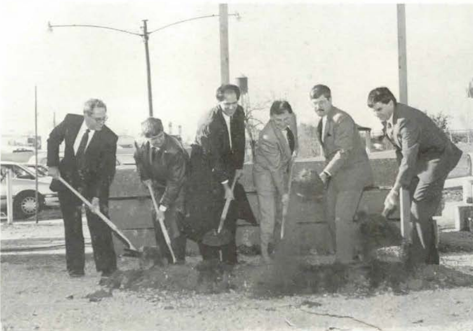
The ground is officially broken.