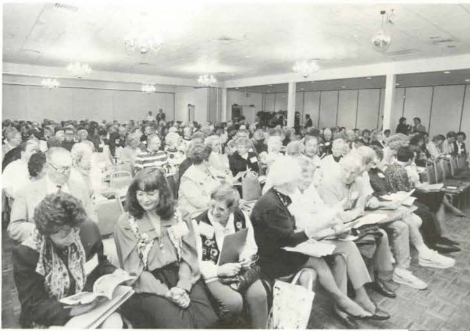
Participants at the 3rd Czechoslovak Genealogical/Cultural Conference held at the Sheraton Inn Hotel and Convention Center, Cedar Rapids, Iowa.