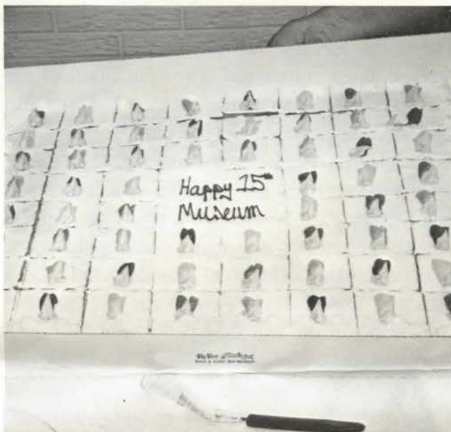
A 15-year milestone for the museum.