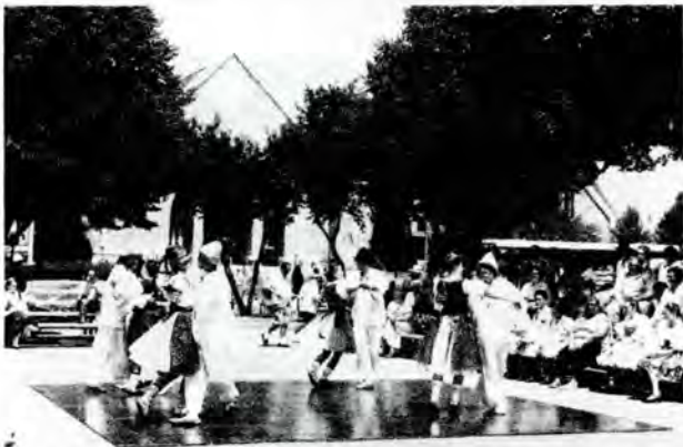
United Moravian Societies Vandrlaci Dancers

This year, the National Czech & Slovak Museum & Library (NCSML) welcomed over 50 dancers, musicians, and demonstrators to the 4 th National Bohemian, Moravian, and Slovak Folk Dance Festival. The Festival was held just outside the NCSML on July 16-17, 2005. Some 600 people attended the two-day event and over 100 volunteers helped make the event a success. As you can see by the photos, we had a terrific weekend.