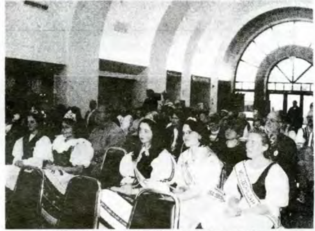
Czech Royalty in the Audience at the National Czech & Slovak Museum & Library