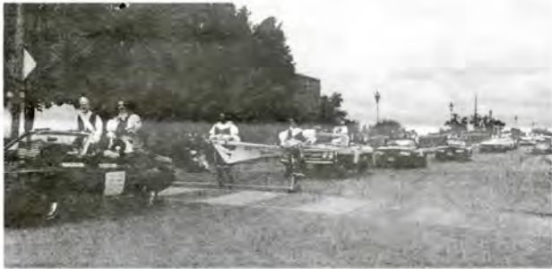
11 Cars Filled with Czech Royalty and Pageant Contestants Led the Houby Days Parade