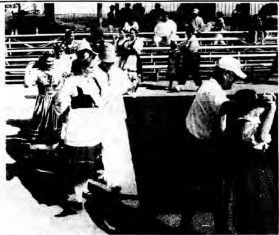
The Oklahoma City Czech Dancers Joined by Czech School Students

Audience members, including Czech School students, had a chance to learn a folk dance or two with the Oklahoma City Czech Dancers on July 17, 2005.