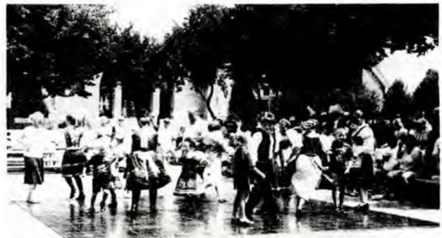
Audience Members Learning the Tatra Polka

United Moravian Societies Dancers and the St. Paul Czech and Slovak Dancers all performed the National Slet Dance as the finale for the Bohemian, Moravian, and Slovak Folk Dance Festival. Afterwards, audience members learned one piece of the dance, The Tatra Polka.