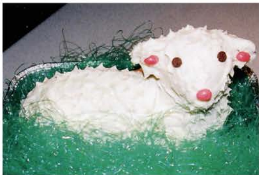
Lamb cake created by Grant Wright of Cedar Rapids, IA.

Winner of the children's division receives a $25 gift certificate to the NCSML store and a $5 gift certificate from Sykora's Bakery. Adult division winner receives a $50 gift certificate plus a $10 gift certificate from Al's Blue Toad restaurant. Although not required for competition, lamb cake pans are available for purchase in the Museum Store.