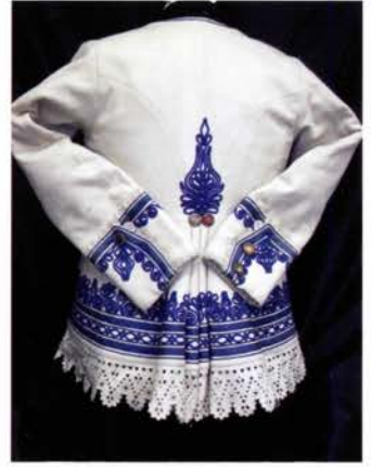
Wool jacket with blue embroidery and cutwork. The donor purchased the jacket at an antique store in Bratislava. Gift from Marilyn Langhurst 2010.10