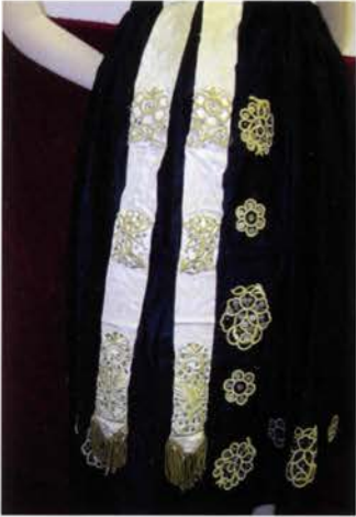
Kroj from Western Slovakia. The costume is from the early 1900s. It was made and worn by the donor's grandmother. The top shows a close-up of the exquisite detail on one of the ribbons. The bottom image is a view of the back of the apron and the goldwork sash. Gift from Jana Magnuson 2010.17