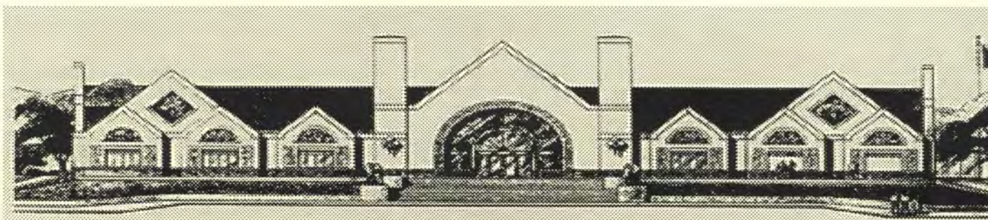
National Czech & Slovak Museum & Library 30 - 16th Ave. S.W. Cedar Rapids, Iowa

Overlooking the river is Cedar Rapids' finest rental hall, uniquely set in the new National Czech & Slovak Museum & Library.