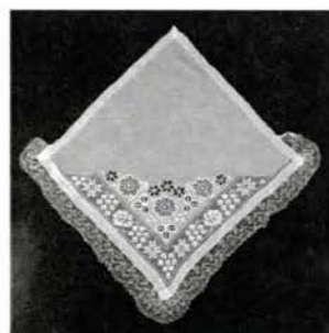
Lace Scarf – Bobbin Lace

Five original embroidery and lace patterns inspired by items in the exhibition have been created for sale in the museum store. Pattern classes for each item are offered over the course of the exhibition.