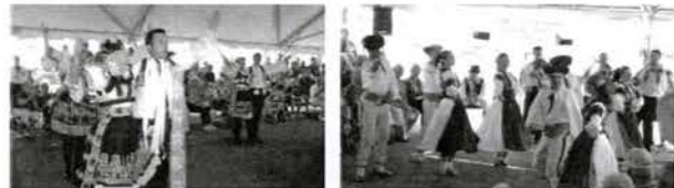
Snapshots from Previous Dance Festivals

Sponsored by Western Fraternal Life Association