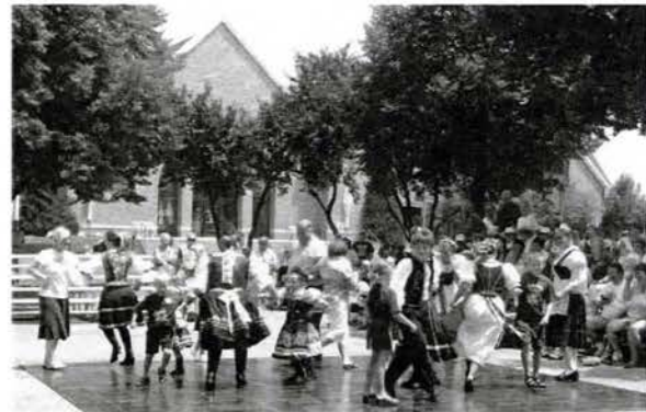
Audience Participation at Previous Dance Festival

2006 National Bohemian, Moravian, and Slovak Folk Dance Festival is always a grand celebration, and this year, it is much more. A whole weekend of festivities is planned.