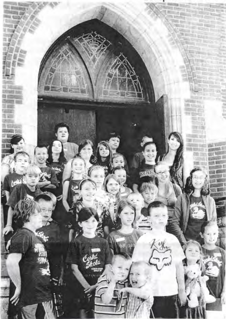
St. Wenceslaus Catholic Church front steps provided staging for the Czech School's group photo.

School tours returned to NCSML in Czech Village following the April grand opening. This summer children's tours as well as adult groups and individuals enjoyed RISING ABOVE: the story of a People and the Flood in Historic Czech Village.