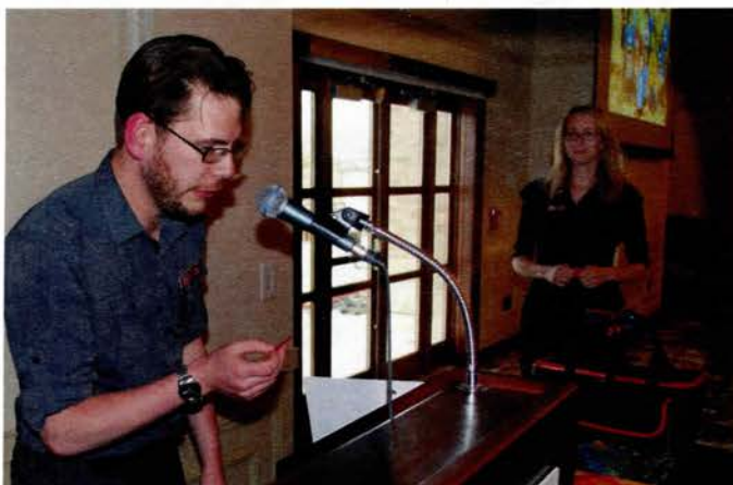
Appreciation Dinner