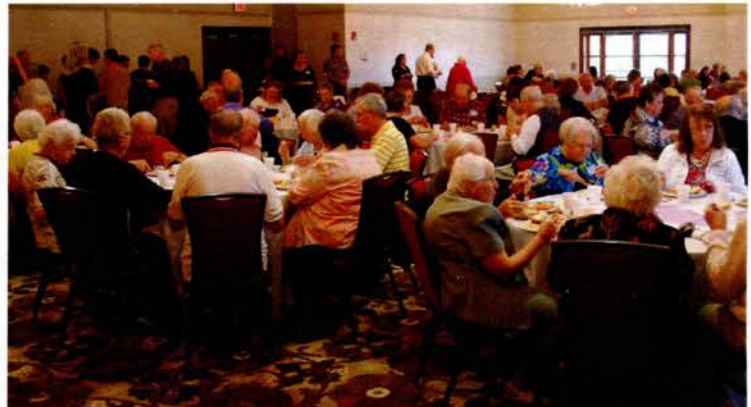
A full house was on hand for the Volunteer Appreciation Dinner